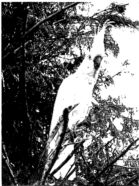
V (a) — Sulphur-crested Cockatoo

near Hunterville, where there are said to be 'hundreds' in the back-country. Another flourishing pocket of these big, raucous cockatoos exists between Raglan and the Waikato estuary.