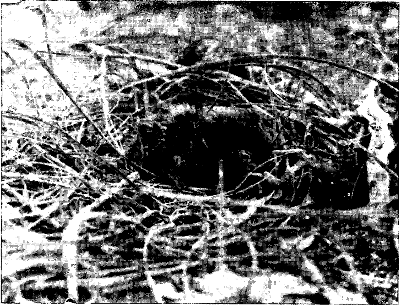
FIGURE 2 — White-winged Black Tern chick at nest, 6 February 1974. Note the broad white circle around the eye.