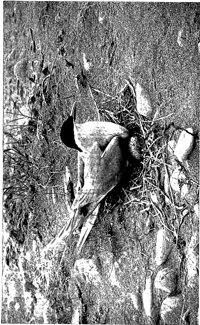
BLACK-FRONTED TERN AT ITS NEST, NORTH CANTERBURY.