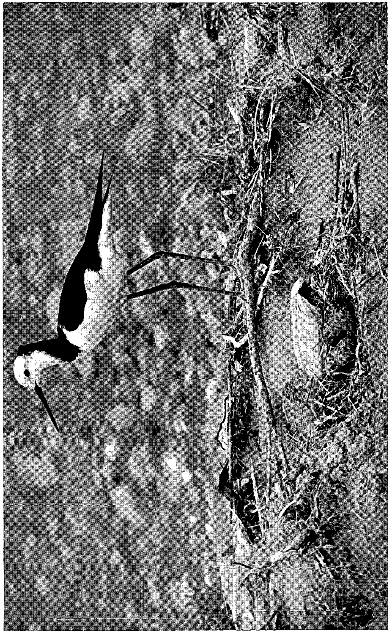
WHITE-HEADED STILT BESIDE NEST, NORTH CANTERBURY.