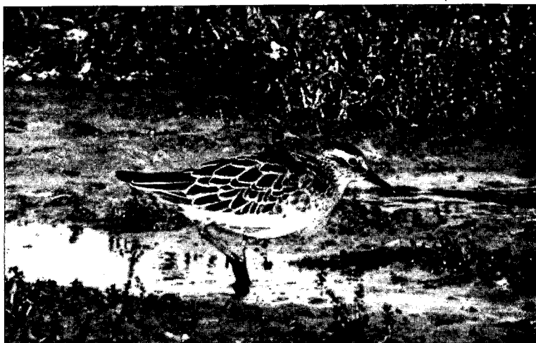
Sharp-tailed Sandpiper ( C. acuminata ), Miranda, January 1955. Small numbers of these sandpipers regularly reach New Zealand. The species has recently been found as far south as Invercargill.