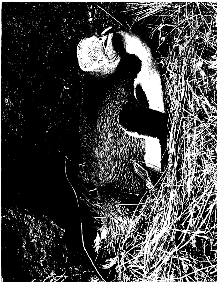
IF. C. Kinsky

XLVIII — Adult Yellow-eyed Penguin incubating, late October, 1960, on the Otago Peninsula, which is near the northern limit of the rather restricted breeding range. This large, handsome species is found only in the New Zealand region.