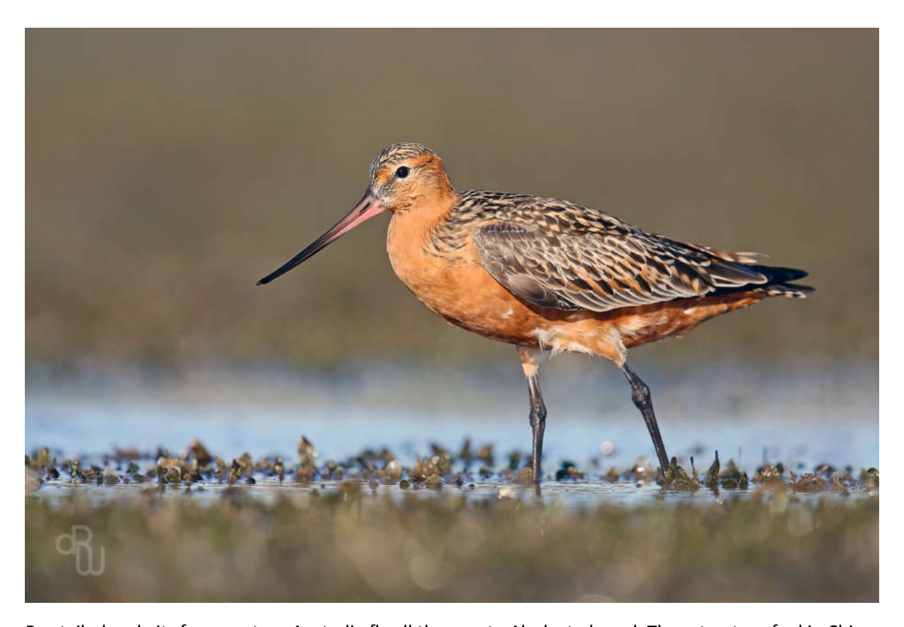
Bar-tailed godwits from eastern Australia fly all the way to Alaska to breed. They stop to refuel in China and Korea on their way north, but fly non-stop from Alaska to Australia on their journey back south.