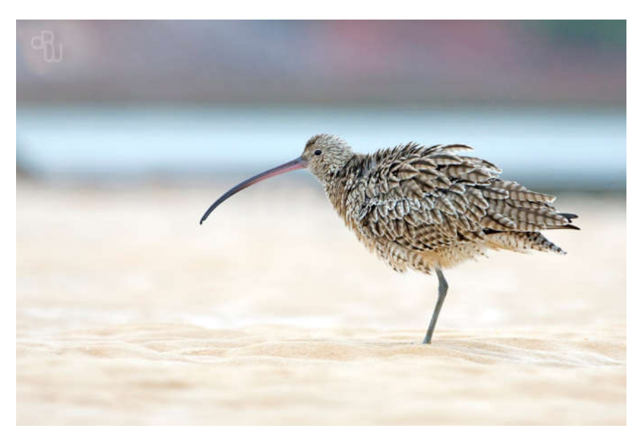
The Eastern Curlew migrates from Australia to Russia, where it breeds. The birds stop to refuel in China and Korea along the way.