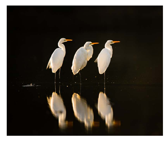
Three of the White Herons recently seen at Tomahawk Lagoon, Dunedin

The Conference was very well organised, right down to the recorded NZ Falcon call which