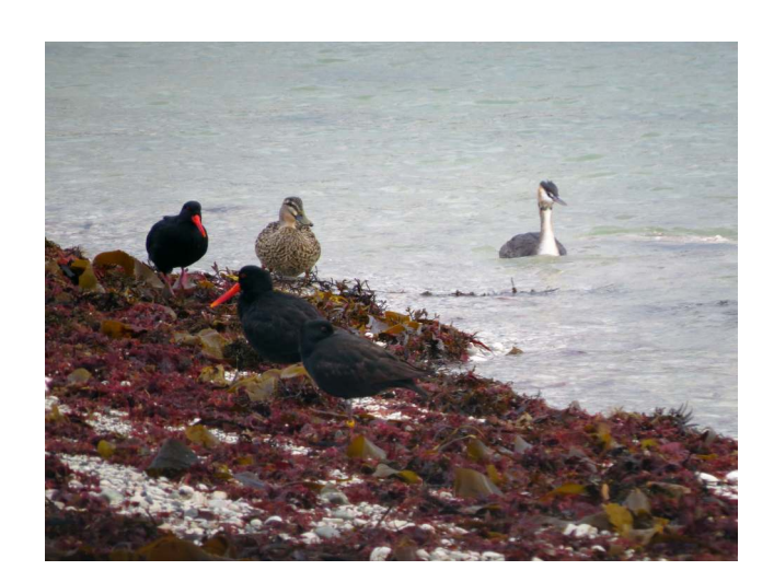
Crested Grebe and, at the front of the group, the banded Variable Oystercatcher, Kaikoura