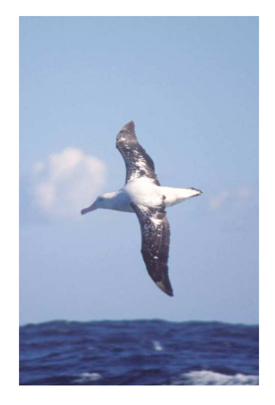
Wandering Albatross

time (21-24 May 2004) it was a great to get out on the water. It does mean in future we'll be organising some