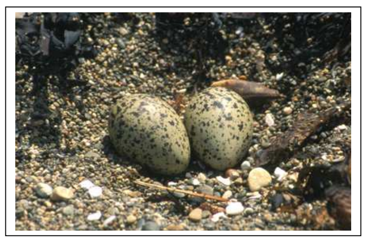
New Zealand Dotterel & eggs.