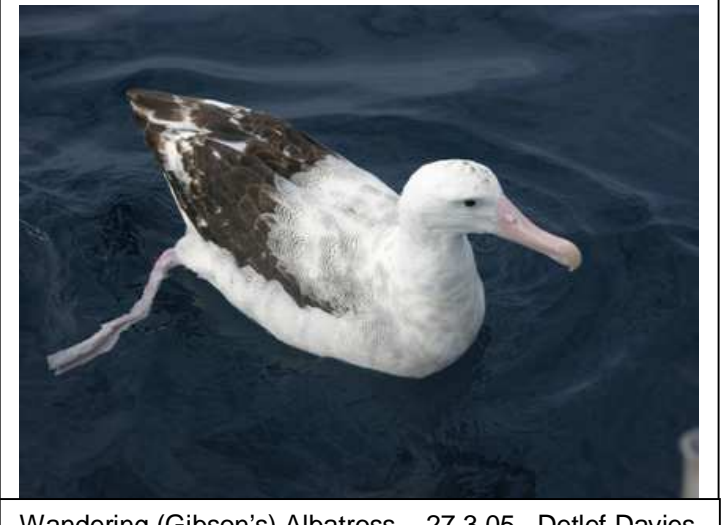
Wandering (Gibson's) Albatross 27.3.05