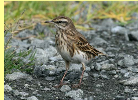
New Zealand Pipit (DD)

On a cold day with strong westerly winds blowing (13<sup>th</sup> June) I went with a neighbour Annie Mae Crene up to Spirits Bay. We saw 2 VOCs on the open beach & 8 Pied Shag up the creek a little. In a small pohutukawa tree overhanging the creek we saw one Black Shag & 3 nests in this tree with 2 of the nests occupied by Pied Shag. There is a new ablution block in the camping ground. Cold water showers! We went to Te Hapua in the late afternoon. The sun was shining on the Spoonbills which were feeding all over the low tide area in front of Te Hapua village but they were just too far away to count. While driving down Heath Road in the Waiharara area on 14<sup>th</sup> June we counted 25 Cattle Egrets feeding around the legs of the cattle. They seem to favour this area. This is the smallest number I have counted here for a long time. I have seen a few in the Paua paddocks some years back.