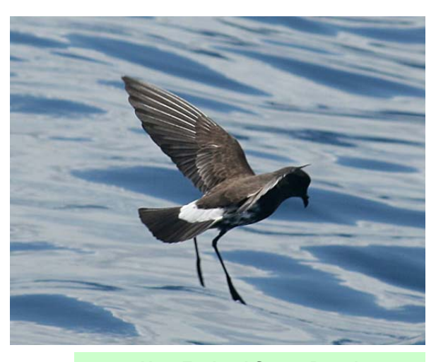
New Zealand Storm Petrel Alive & well in the seas off the Far North. Photo from Hauraki Gulf (DD)

Little Penguin – A few on all the pelagics & several coastal reports