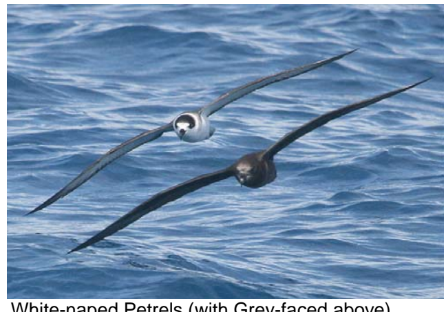
White-naped Petrels (with Grey-faced above)