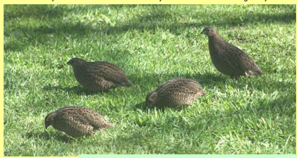
they were talking & twittering to each other very very quietly all the time. I stayed watching them for about

the door open & my feet out on the grass having my cuppa & my last sandwich they scuttled around the grass beside my feet pecking for crumbs. I sprinkled some more crumbs there, reached my camera photographed them right beside my feet. They then went into a dusty area about a metre away to preen & fluff about in the dust. I got out of the car, crawled along on my belly until I was really close & clicked away. The little Quail took no notice of me. They stayed in a little covey of 8 &