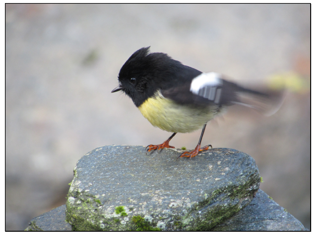
April 2016. South Westland. Richards's comment: .."he was just getting his rotor speed up!

I missed seeing the bittern in Napier that some of the other conference delegates spotted (Closer to home Don H saw one in Parapara Est on May 5) but was thrilled to see black-fronted dotterel Napier and Tauranga, and NZ dotterel mainly Tauranga but also round the top of East Cape. Check out OSNZ/Birds NZ website for coverage of the well presented scientific papers.