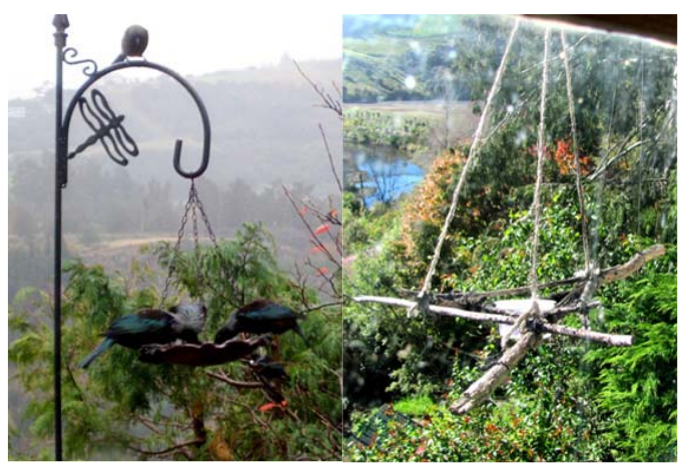
Feeder Styles. Left: Hamish's top of the range sugar water feeder. Right: Derek's Waitati economy model.

Connie Wright saw tens of thousands of Red-billed Gulls at Hooper's Inlet on weekend of May 9th (2 days after the easterly storm) and Mary Thompson saw thousands roosting on King's High rooftops the same day. After high winds during the same week there were over 1000 Black-billed Gulls in Blueskin Bay and similar large numbers at Karitane.