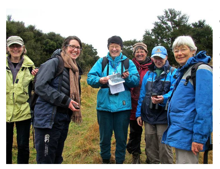
At the briefing at Kelvin's Manse Rd farm.

The method has now been finetuned to 5 minute bird counts in each habitat type marked by GPS. The next trip was to the Mt Watkin area with 8 intrepid surveyors lead by Kelvin. There was fine drizzle all morning but very calm conditions so listening for birds was excellent.