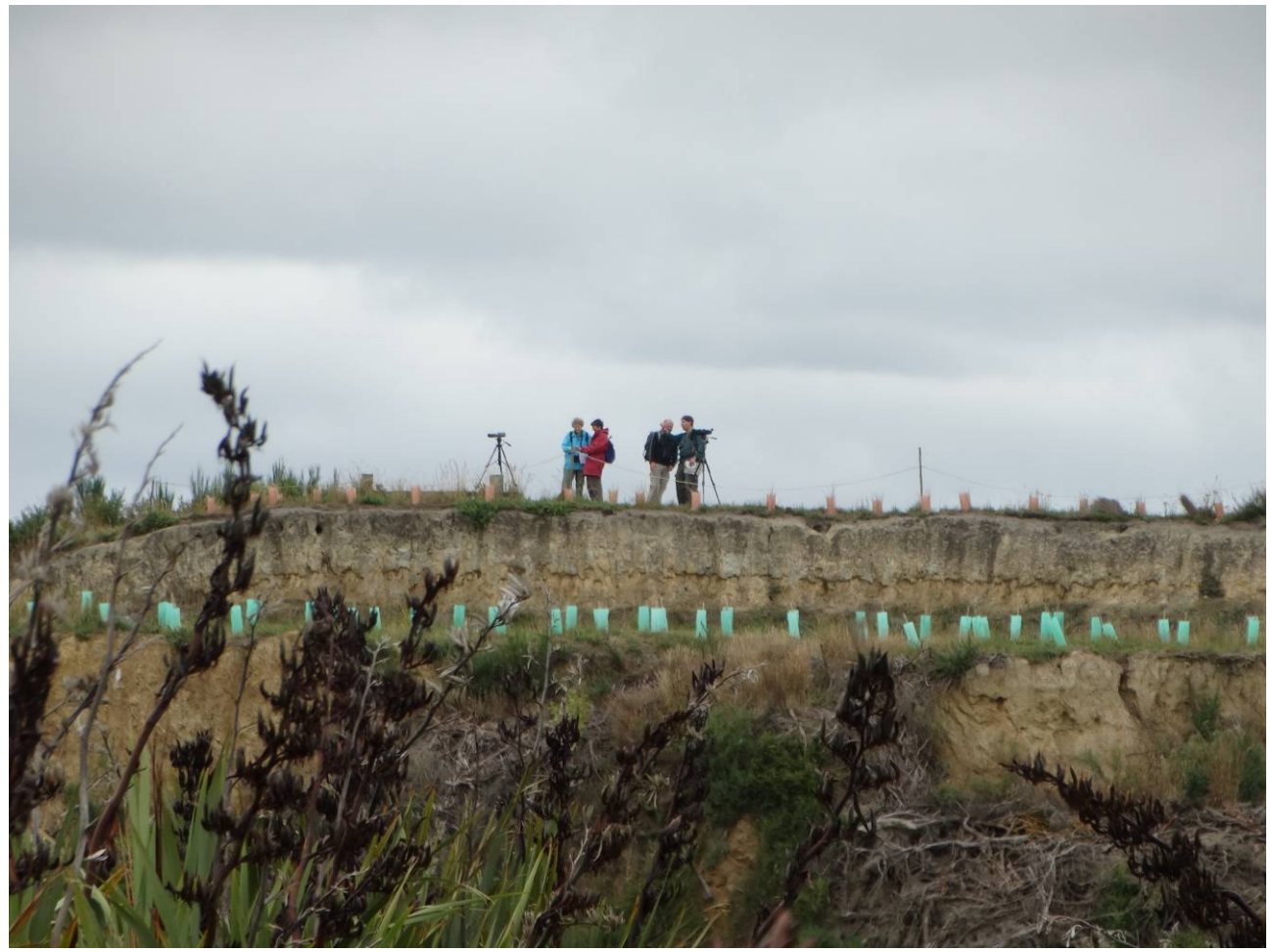
That's 39 green ones and 19 brown.

After a week of rain and gloomy weather it was great to get outdoors and head to the Sinclair Wetlands for the summer count. Seven members took part. We had enough teams to do the 5minute bird counts in duplicate.