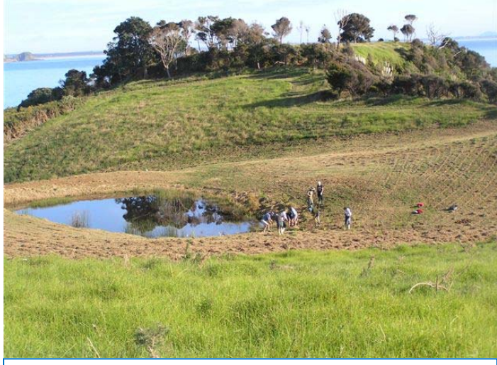
Planting day in June 2008 (Dave Panckhurst) Group of planters working near the stock water pond with Otanenui Pa in the background.

Friends of Taumarumaru is a small group of volunteers, including some members of OSNZ, which has since 2000 worked on improving the reserve by controlling weeds and planting native species. The first planting was in 2000 when 80 pohutukawa were put in at a community planting along the seaside boundary. Since this time annual plantings have included many other species such as flax, karo, coprosma sp, puriri, kahikatea, manuka, kanuka, cabbage trees and others.