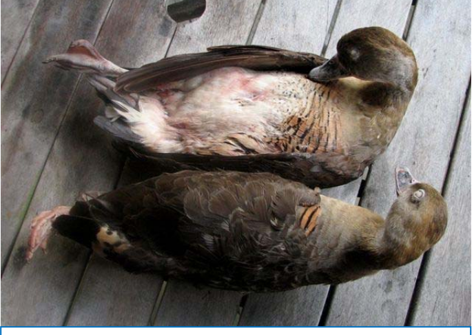
Plumed Whistling Ducks

This is a reminder for hunters to make sure that they identify their target and for Fish and Game to emphasise this. In my opinion smaller duck like the Australian Shoveler should be removed from the game licence, this may help reduce mistaken identity deaths with our teal and scaup. The Plumed Whistling Duck is also about the same size as our Shoveler. As an added note it would be more than timely that Fish and Game seriously considered the predicament of our native Grey Duck which is has been elevated to the nationally critical list and still ironically remains on the Game Bird Licence.