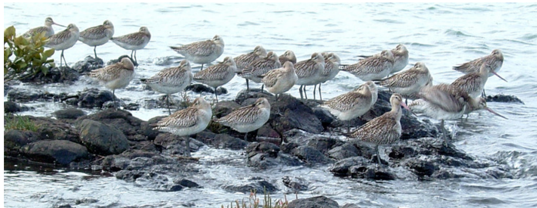
Bar-tailed Godwits on Aroha Island