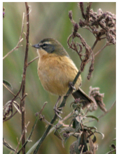
Many-coloured Rush-Tyrant (above) & Long-tailed Reed Finch (right)

I will start the ball rolling with a little Argentina experience. Buenos Aires, although not nearby or cheap, is a single hop from Auckland and has a wealth of birds within a small radius of the city. 80 or more species in a day is easily achieved. We spent 4 days there during our recent holiday and even after 2 previous trips, we found another 20 new species.