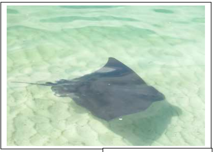
Eagle Ray, Parengarenga