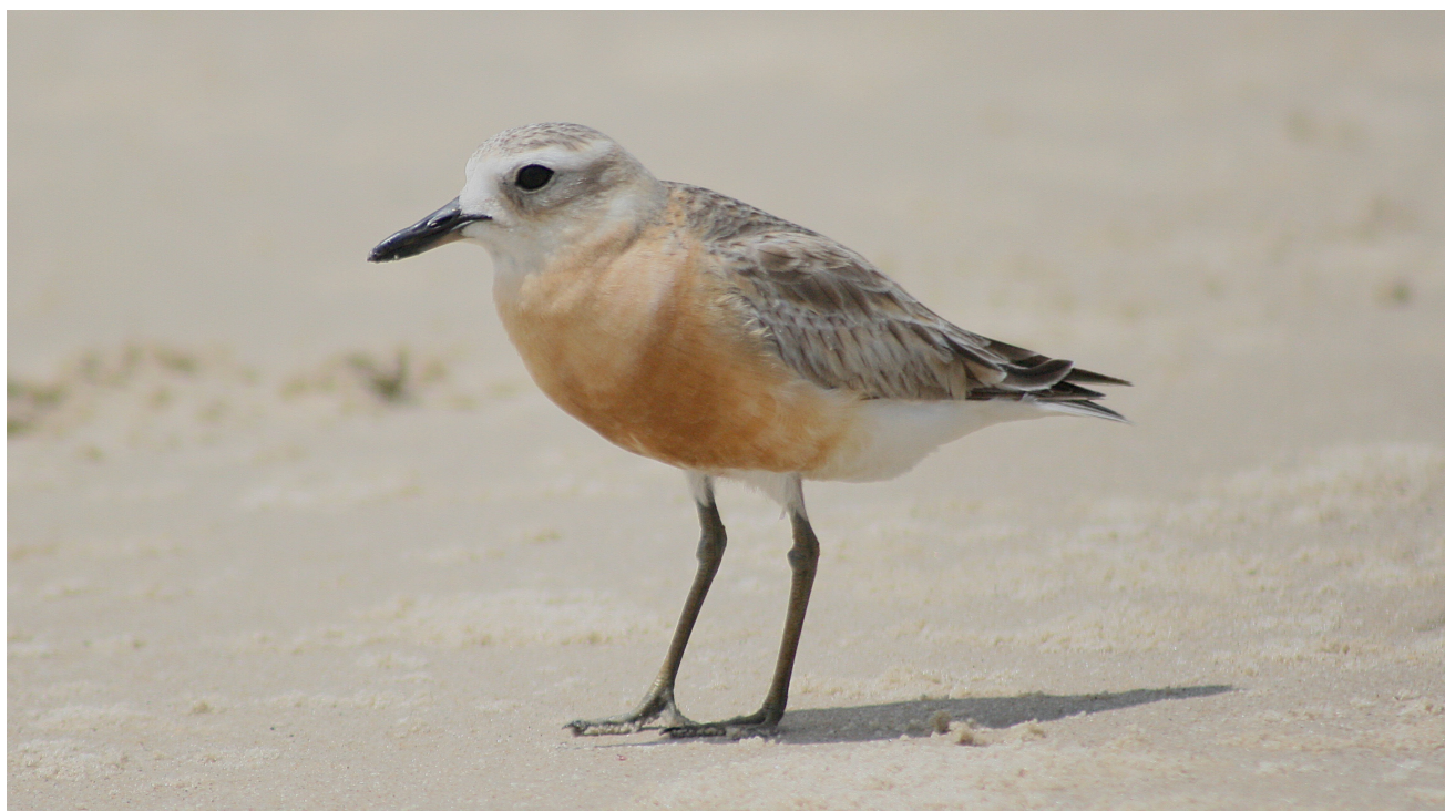
New Zealand Dotterel – Kowhai Beach, 8 Nov 09 (DD)