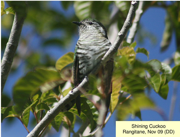
Shining Cuckoo Rangitane, Nov 09 (DD)

Caspian Tern 4 on Kokota Sandspit, 4 on Kowhai Beach, 7 Nov, 1 Unahi Rd, 1 Wallace Rd, 8 Nov, 8 Tauranga Bay 13 Dec.