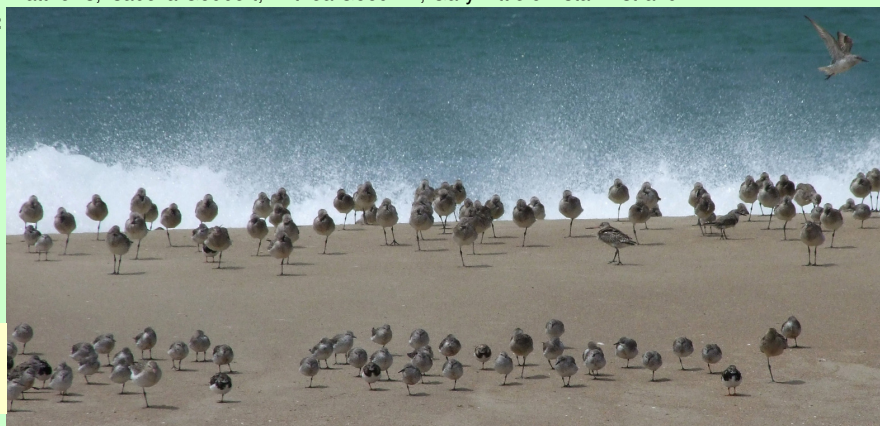
Godwits & Knots – Kowhai Beach (Gary Little)