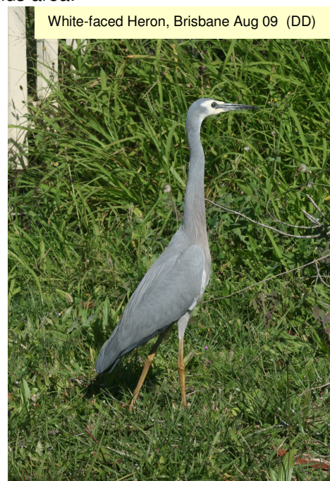
White-faced Heron, Brisbane Aug 09 (DD)

Black-backed Gull 50 at breeding area on Kokota Sandspit, 7 Nov.