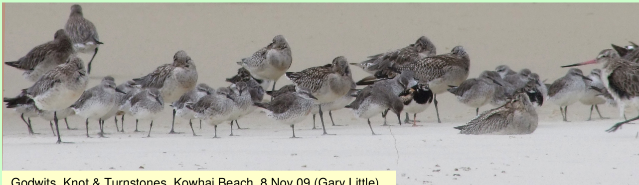
Godwits, Knot & Turnstones, Kowhai Beach, 8 Nov 09