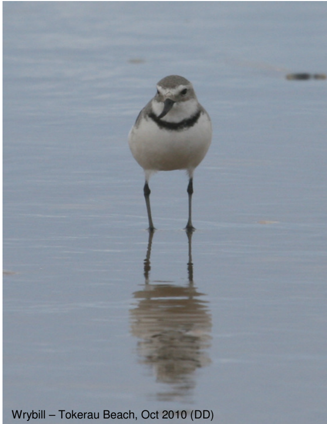
Wrybill – Tokerau Beach, Oct 2010 (DD)

Red-legged Partridge – a report of one seen in a garden in Kerikeri late last year (BFJ). There was another in Kerikeri a few years ago, presumably from a local collection.