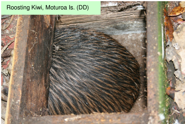
Roosting Kiwi, Moturoa Is.

Australian Little Grebe – Recorded on same lakes as above, max 12 on Lake Rotokawau.