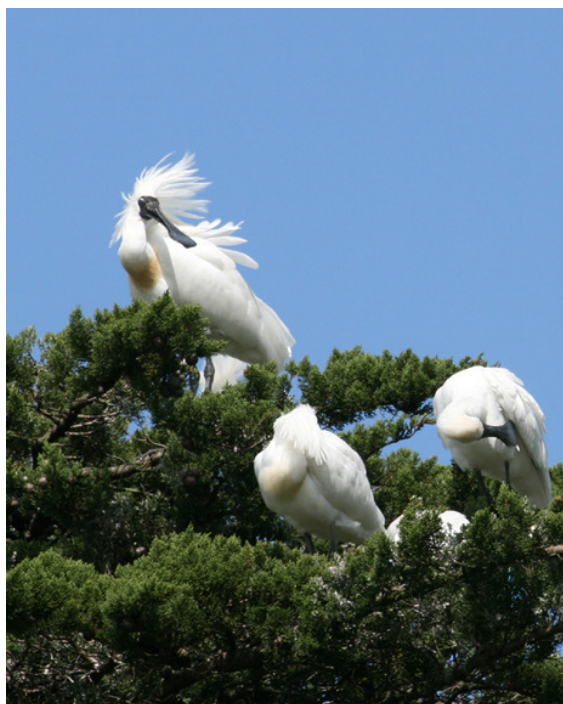
Royal Spoonbills in the wind at Awanui (DD)

Royal Spoonbill – Numbers of birds roosting in the trees at Awanui Wharf reached over 500 but tailed off during December. None present early January. Small roosting flock in Kerikeri Inlet at least until November (BFJ).