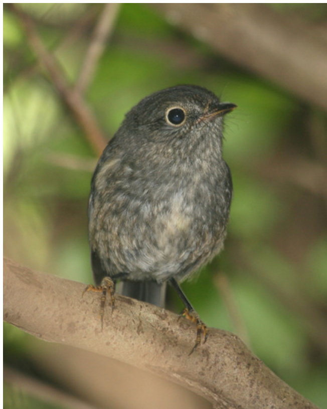
North Island Robin – Moturoa Island, 25 Dec (DD)

Redpoll – 2 on Urupukapuka Island on 17 Nov may be a first record for the island (CD).