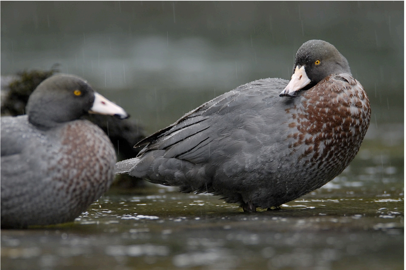
Blue Duck Craig McKenzie