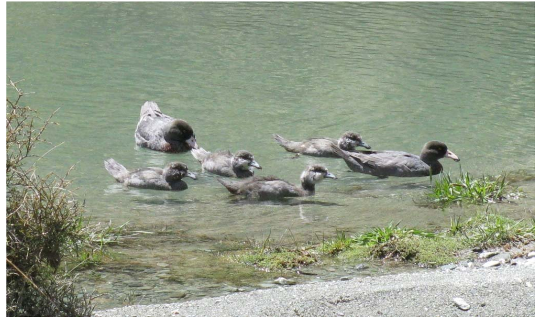
Barry Lawrence DoC, Wakatipu

We now have stoat control in place along 105 kilometres of river. In 2007, a pair were seen in the Fraser Valley (upper Caples), and in July 2008 three more were seen at the Kaye Creek junction, indicating that we may have a breeding pair. However, a survey this January found no sign of them. In the Rockburn, though, we have known of a pair since 2005 and finally, last December, they were photographed with four ducklings. Then in January a further two ducklings were observed. The last confirmed Whio breeding in the Wakatipu area was in 1983 in the Routeburn so this is great news.