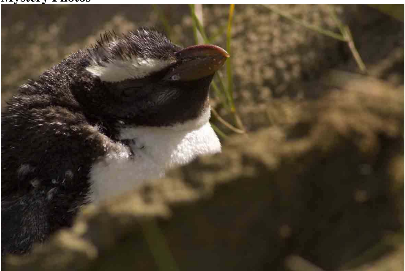
Why is this a Fiordland Crested Penguin?