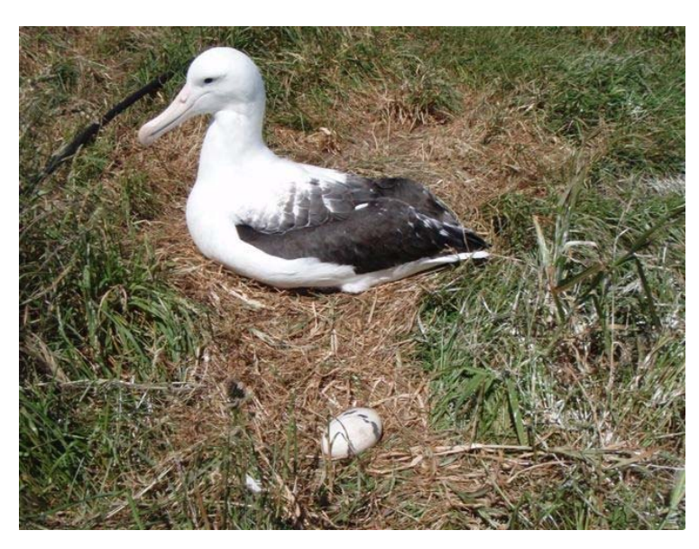
A dummy egg rolled out of a flattened nest

Currently there are 30 eggs with four more pairs present that may produce an egg and that could lead to, or exceed the highest number of eggs laid at Pukekura (32 laid in 2002). Although we are at the very early stages of incubation there are four eggs currently in the incubator. Three eggs came from poorly constructed nests and it was likely the egg would break/roll out if left in the nest (as has now occurred with all three dummy eggs placed in each nest).