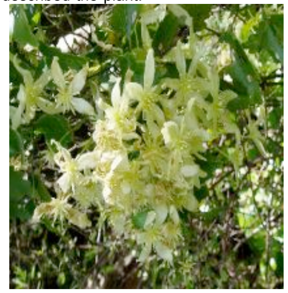
Clematis Foetida (foul-smelling) The rich creamy-coloured flowers were very eye-catching, especially in the dappled sunlight.

The comparative dearth of birds was perhaps due to the high winds. Undaunted, the group took the opportunity to discover some botanical treats. Colin Scadden was especially able to contribute his knowledge of ferns, shrubs, trees, lichens and climbers. In quoting Latin names, Colin pointed out that such names actually described the plant.