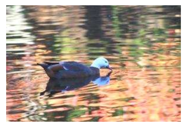
Lynne photographed this female Paradise Shelduck at Virginia Lake, with the reflection of the autumn colours of the leaves giving a sense of the bird swimming in molten metal.