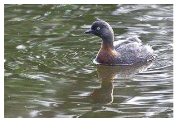
NZ Dabchick photographed at Pohangina wetlands, 1 November 2009.