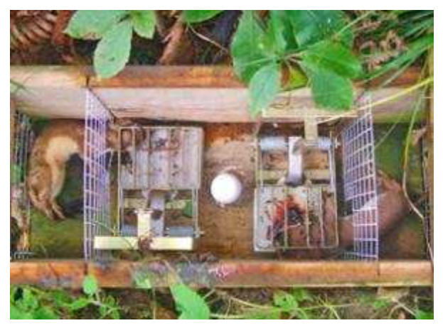
Stoat caught in a DOC200 trap, baited with an egg.

The high adult survival and reasonably high nesting success has been largely due to the predator control programmes carried out along these rivers in recent years. These control programmes are integrated Kia Wharite , a joint biodiversity conservation project between DoC and the Horizons Regional Council set up in 2008, involving predator control and habitat protection on about 90,000 ha of private land and the same amount of public land. In 2009/10, 246 stoat, 45 weasel, 4 ferret, 66 cats, 1882 rats and 885 hedgehog were trapped in the security site.