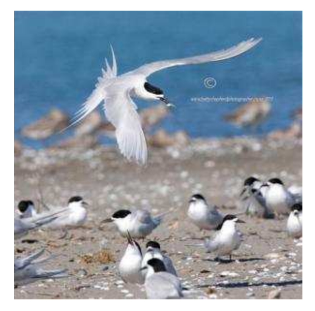
A White-fronted Tern at the entrance to Ohiwa Harbour bringing in a fish fingerling to its mate, 30 November 2008.