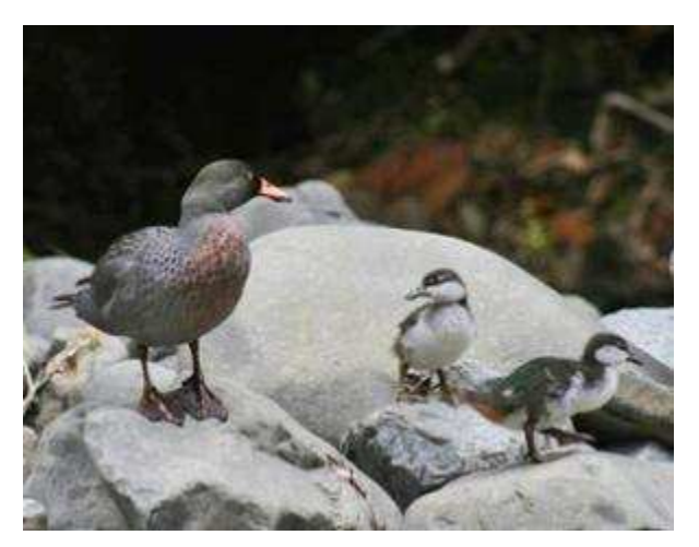
Adult whio with two ducklings.

Breeding success was marginally higher on the Retaruke and adjacent streams, 1.1 fledglings/pair, but it is not clear if all the resident pairs attempted to breed. Sixteen broods were produced containing a total of 41 ducklings, of which 32 survived to fledging (duckling survival: 78%). Most ducklings were apparently lost during both catchment-wide and local floods.