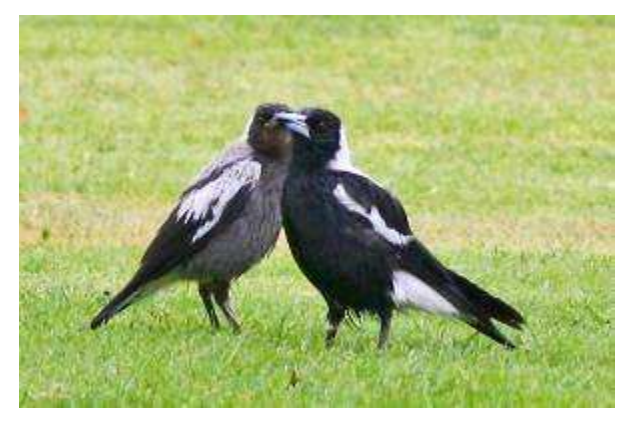
For some years, Lynne has been watching and photographic particular groups of Australian Magpies in Castlecliff and Springvale. Here the female is about to feed a fledgling a bug caught on the sports field at Springvale Park.