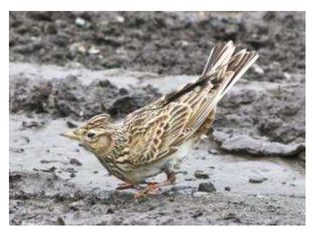
A presumed male Skylark adopts an aggressive posture during a fight with another skylark.