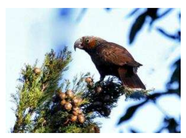
Kaka feeding on a macrocarpa at Virginia Lake, September 2010

Does the increase in reported sightings of kaka suggest an increase in the number of birds in the region, or is this just an artefact of more people becoming aware of the importance of reporting such sightings? This year, for example, in addition to the birds seen in Wanganui, we received reports from Turakina (April, Dawne Morton), Fordell (June, Peter Serkin), and Mt Lees (October, third-hand via Phil Thomsen). Where do these birds come from? And, again, are they young birds or adults (or both)? Are these winter movements part of a regular pattern of dispersal or seasonal relocation, or are the birds being forced to move because the areas that they are in cannot sustain them during winter, for one or other reason (e.g. habitat degradation)?