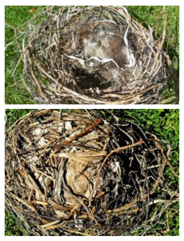
Cup (top) and base (bottom) of an Australian Magpie's nest. The wire-like strands are the stems of Muelenbeckia.

Lynne Douglas circulated an email to some of us with photographs of the nest of a pair of Australian magpies that she has been observing at Castlecliff Beach. The nest was blown down during one of the recent bouts of high wind. She wrote: "...note the amazing construction. The basic structure is woven from long flexible sticks and Muelenbeckia strands, along with strips of black plastic shade cloth, white plastic, etc,. The lining is interesting as it consists of white and brown sheep's wool, horse hair, moulded newspaper, spider webs, dog hair, sand, plastic film, grass, plant fibre (cabbage tree leaf) and other items; even items from the [Wanganui] Chronicle puzzle page. Surprisingly, it does not contain any wire, which I have seen in most magpie nests."