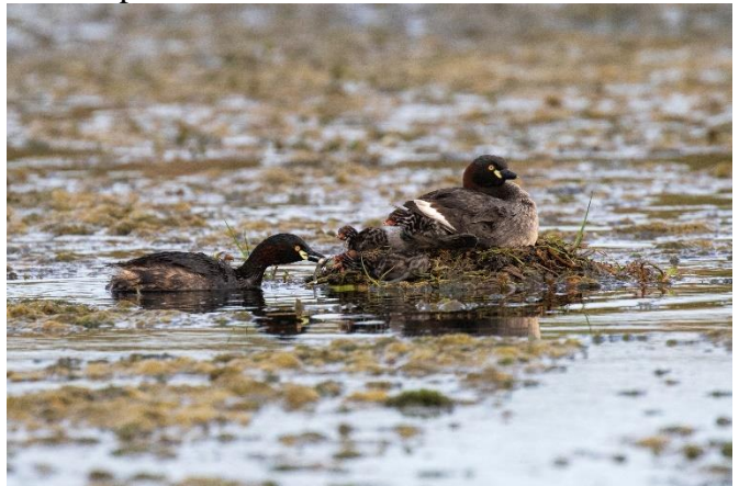
Little Grebe feeding chicks above