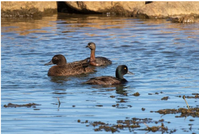
Pateke, Dabchick and Scaup above