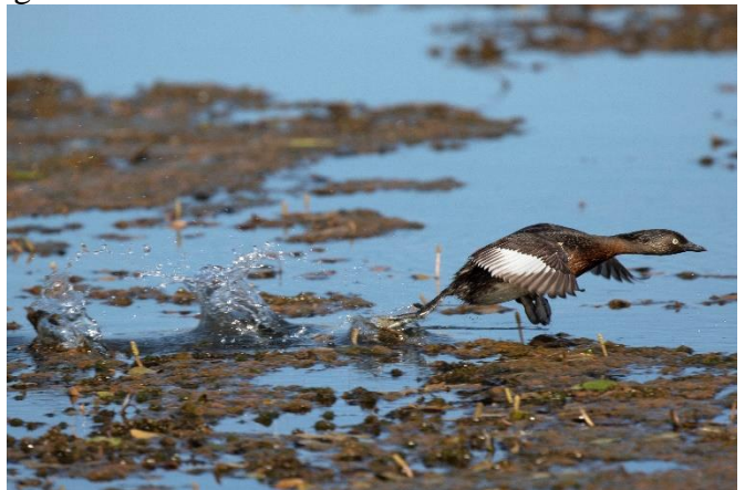
New Zealand Dabchick