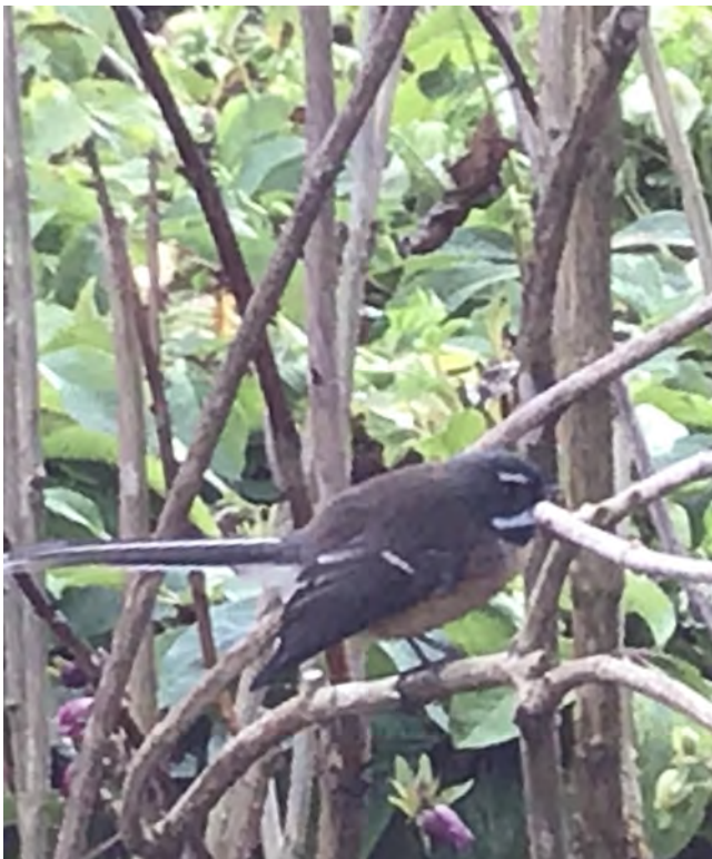
A fantail at the Christchurch Botanic Gardens in mid-July.