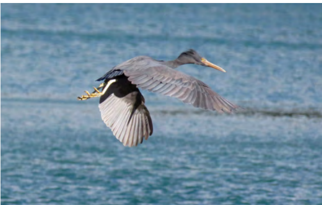
Pacific Reef Heron (Matuku moana), Jackson Bay, Westland. Now this was an unexpected sighting! While my parents and I were looking out for Fiordland Crested Penguins at the Jackson Bay heads, I suddenly saw a Reef Heron fly past us, followed by a few others. It seemed to be two pairs that were in the midst of a territorial confrontation, though at least one of the herons seemed to keep its distance from the others at most times. After a little while one of the pairs flew off further up the coast, while the victors flew back to a vegetated rock stack, where they landed and presumably nest. Thankfully at that time my dad and I were doing an ebird checklist, so this was recorded down for all to see!