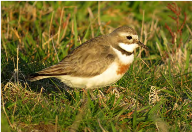
Banded Dotterel (Pohowera) (female), Okuru, Westland. This female dotterel was foraging alongside several others on a field next to the Okuru Lagoon. These dotterels came rather close to us, within 5 metres away! This female especially let me get some great photos, such as this.