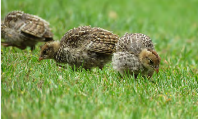
California Quail chicks, Christchurch Botanic Gardens. We were very surprised to find a California Quail family in the busy botanic gardens out of all places! The family contained both parents and 7 chicks, as well as another male which seemed to be tagging along for one reason or another. I was surprised by the fact that many people did not seem to notice the quail family, as several people walked right past them, and someone even almost walked right through them.