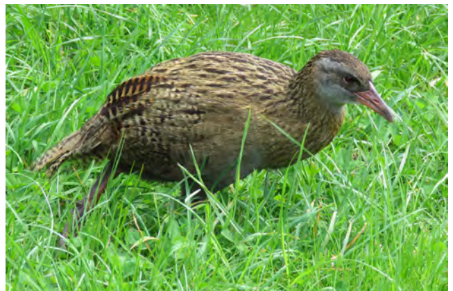
Buff Weka, Mou Waho Island, Lake Wanaka. Buff Weka of course were the distinct Weka population that used to inhabit the eastern regions of the South Island, including the area most applicable to us, what is now Canterbury. Unfortunately due to a variety of factors such as overhunting, habitat loss and invasive mammalian predators, Buff Weka were nearly entirely wiped out. In 1905 some Buff Weka were introduced to the Chatham Islands, where they thrived, and still continue to do so. For at least a few reasons, there have been few attempts to reintroduce Buff Weka back to their native eastern South Island range. However, the population on Mou Waho Island, a pest-free