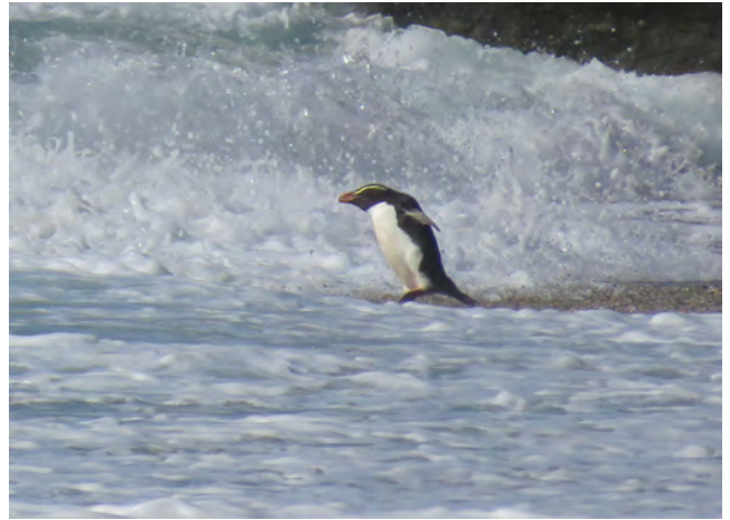
Fiordland Crested Penguin (Tawaki) about to enter the sea, Monro Beach, Westland. Getting to see these birds for my first time was truly splendid, and Monro Beach is definitely a great place to see them! Due to these penguins being very shy and easily disturbed, combined with a 'do not go past this point' sign, we made sure to keep a good distance from them and admired them from a distance.