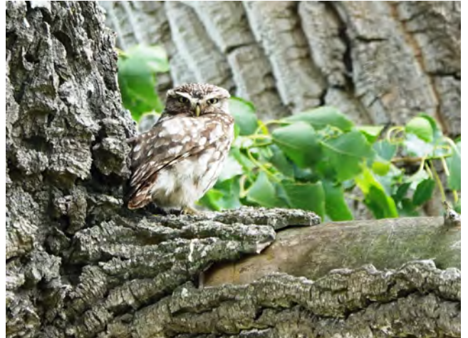
This photo of a Little Owl was taken at Kaiapoi Pa Road in November.