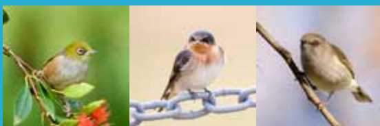
Silvereve Welcome Swallow Grey Warbler