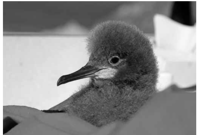
▲ Translocated Hutton's Shearwater chick.