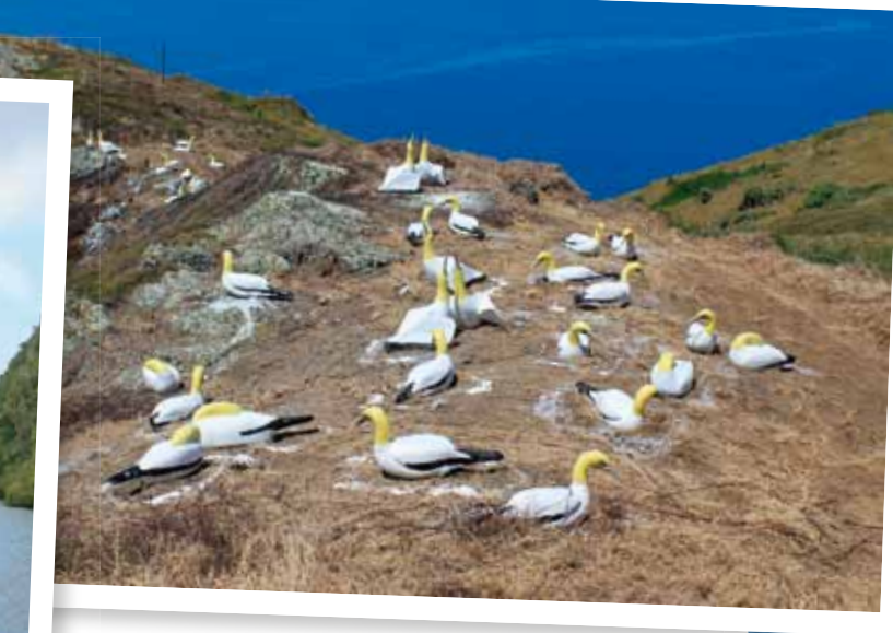
▲ Concrete Gannets to attract the real thing to nest, Mana Island.

Pauatahanui Wildlife Management Reserve. The reserve contains bird hides for viewing shore birds. Birds New Zealand has been monitoring changes in the occurrence and populations of birds in Pauatahanui Inlet since 1982.