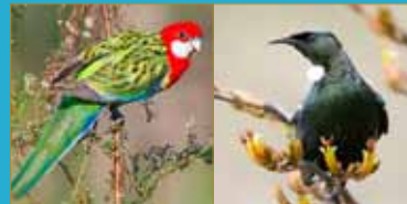
Eastern Rosella Tui