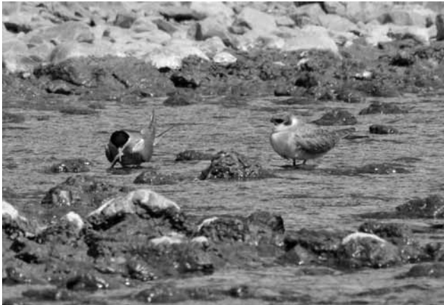
▣ Adult Black-fronted Tern and fledgling on Lake Stream.

I studied a nesting colony of Black-fronted Terns for five days on Lake Stream at Lake Heron, Canterbury, where, to my knowledge, they have not been studied before. From 7th to 11th December 2013 I performed daily observations and attempted counts. The tern nests were mainly on an island in the river but also at its sides. The terrain was undulating, so observation of 'what's on the other side' was difficult. Access on one side of the stream is difficult.