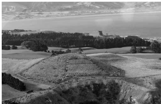
■ The new Te Rae o Atiu colony on Kaikoura Peninsula.