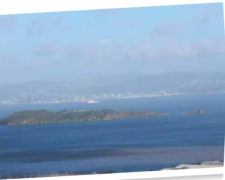
▣ Matiu/Somes Island.