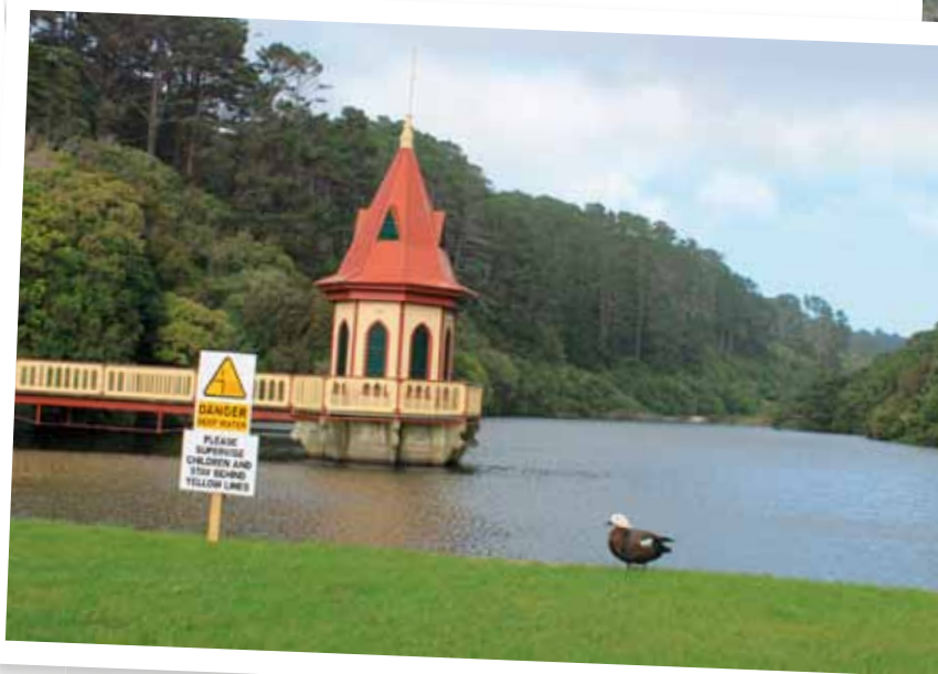
▣ The lower reservoir at Zealandia.

Area: The National Museum of New Zealand. Inside the building are six floors of exhibitions, cafés and gift shops dedicated to New Zealand's culture and environment. The museum also incorporates outdoor