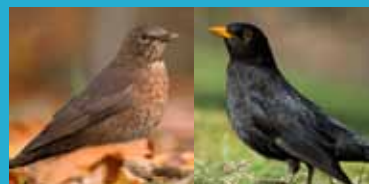
Blackbird (f) Blackbird (m)