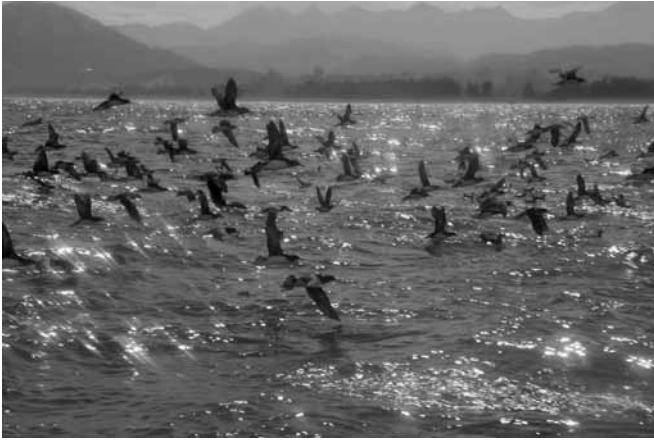
▲ Hutton's Shearwaters at sea off Kaikoura.