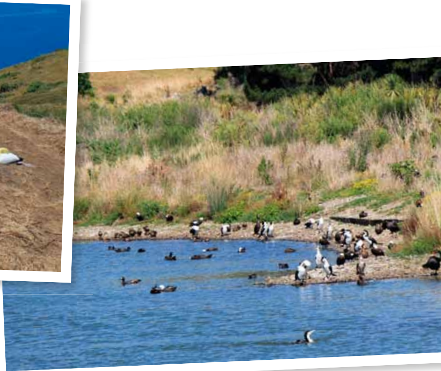
▲ One of the former oxidation ponds in Pharazyn Reserve.