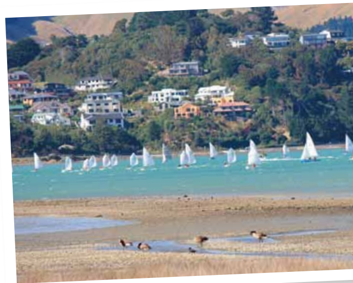
▣ Pauatahanui Inlet.

Features: Forest and Bird have over a number of years carried out a restoration programme on the