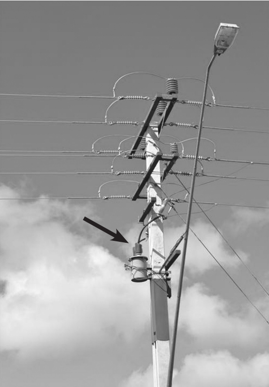
Fig. 1. Example of a electrical pole that electrocuted a juvenile male New Zealand falcon. The pole was later retrofitted with insulators (arrow) to prevent further electrocutions.

Assessing the levels of electrocution and their potential impact on populations of birds can be difficult. For example, it is unusual to directly witness the electrocution of wild birds. Even dead bodies below poles may be quickly scavenged and electrocutions are hard to quantify if some birds survive the initial contact with the power pole only to die later elsewhere (Ferrer & Janss 1999). Although the senior author has witnessed the death of 3 trained peregrines falcons and 2 prairie falcons through electrocution, and 1 peregrine killed by a wind turbine, such anecdotal observations cannot provide a robust estimate of the severity of the problem. In this study we present a quantitative estimate of electrocution rates in a population of radio-tracked New Zealand falcons.