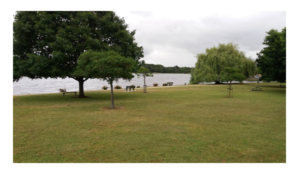
Fig. 2. General view of Henley Lake, Masterton, showing open lake-side habitat.

to the presence and movement of people. All counts were in the morning or afternoon (started between 0820 h and 1054 h, or between 1310 h and 1607 h). On average, counts lasted about 44 minutes at Western Springs Lake and about 40 minutes at Henley Lake. Counts began and ended at the park boundaries (Great North Road for Western Springs Lake and Te Ore Ore Road for Henley Lake). Other details of the counting protocols were as given by Gill & West (2016).