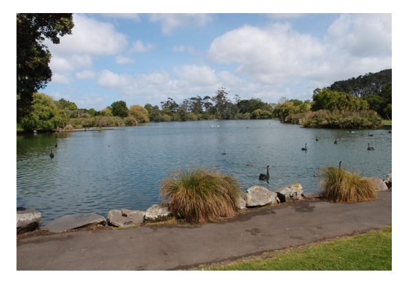
Fig. 1. General view of Western Springs Lake, Auckland, showing section of open lake-edge.

All counts were by BJG. Each consisted of a walk on the path around the lake (a route of about 1.5 km at Western Springs Lake and about 1.7 km at Henley Lake) tallying all water-birds seen on the lake surface, edges of islands visible from the shore, and open land adjacent to the lake. These counting areas were about 12 ha at Western Springs Lake and about 19 ha at Henley Lake. At both lakes, high visibility across the bulk of the counting area meant that any mass movements of birds were seen and doublecounting avoided. Accurate counting was made easier at both lakes by the convenience of the lakeside paths and by the water-birds being habituated