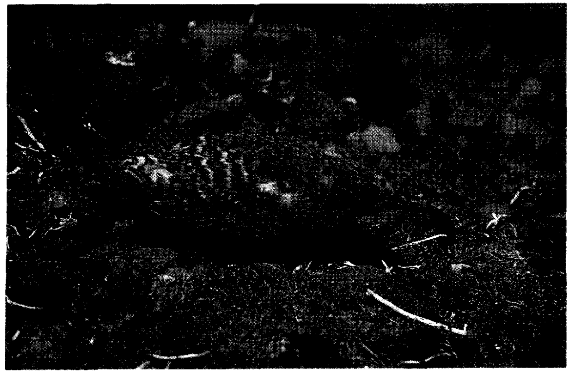
Figure 3 — Fledgling Kerguelen Tern, Kerguelen, January 1985