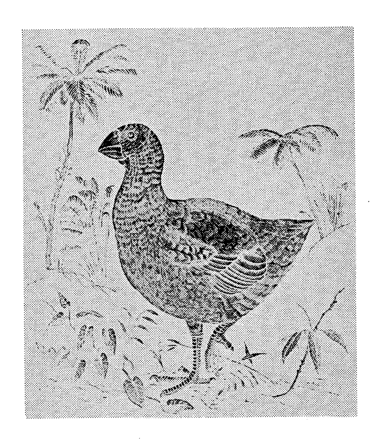
Bulletin of the Ornithological Society of New Zealand. Published Quarterly.