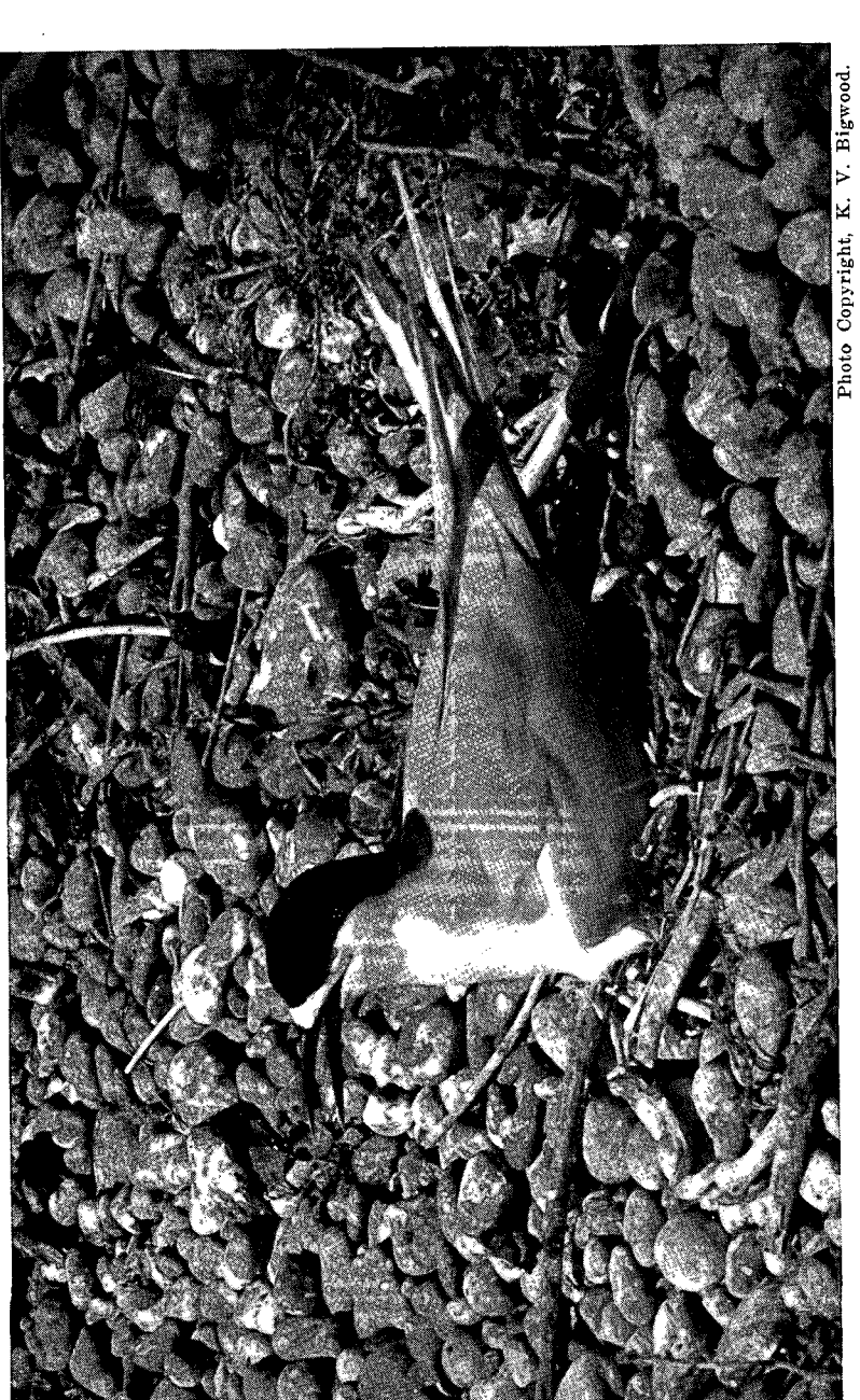
WHITE-FRONTED TERN ON NEST, LAKE ELLESMERE.