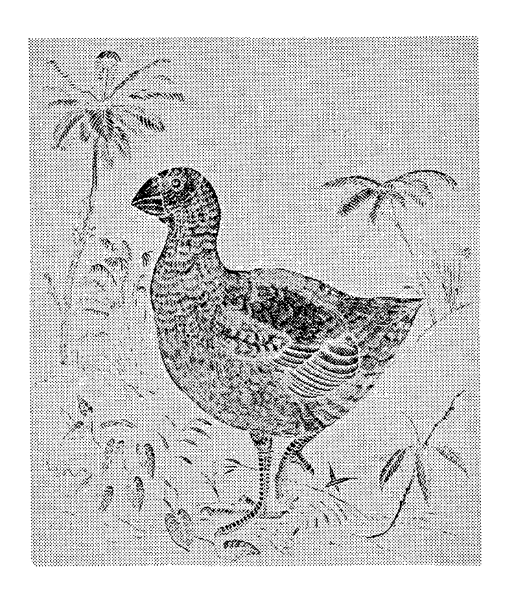
Bulletin of the Ornithological Society of New Zealand. Published Quarterly.