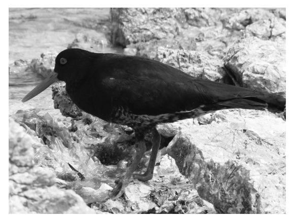
Fig. 1. Unbanded intermediate phase variable oystercatcher from nest 7, Kaikoura, showing extent of white underbelly.

Fig. 2a at the downy stage. Two chicks fledged in Jan 2009; K12088 was of similar colouring to K12072 and K12087 had the colouring of a downy black phase chick (Fig. 3a). All 3 chicks left Kaikoura soon after fledging and were observed in Nelson. K12072 was seen at the Avon-Heathcote estuary, Christchurch, 1 has returned to Kaikoura (K12088), and the current whereabouts of the 3rd (K12087) is unknown. It is the changes in plumage colour in these birds that are described in this note.