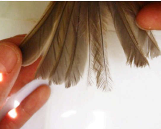
Fig. 3. Tail of a 1Y (FCF) hihi in December, showing mostly replaced fresher tail feathers and 2 central ragged retained juvenile tail feathers. The replaced tail feathers are of similar wear to adults at this time of year.

difficult, even though young are born with unpneumaticised skulls that appear to close over time. Flethy gape flanges (henceforth gapes) appear to last on birds for about 1 month, and caution should be taken, as corners of adult mouths are naturally yellow.