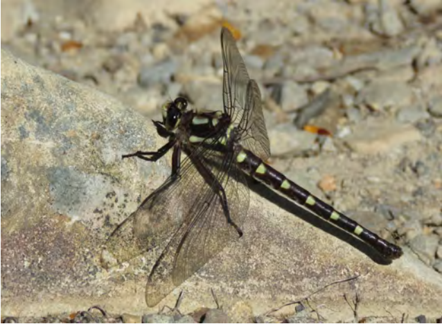
Female Mountain Giant Dragonfly, Bealey Spur Track, Arthur's Pass National Park. Even though not a bird by any means, I still think this photo deserves to be included! These beautiful insects are pretty much equally as adapted for the air as the birds, and their wingspan does rival some of our smallest birds, such as the Rifleman.