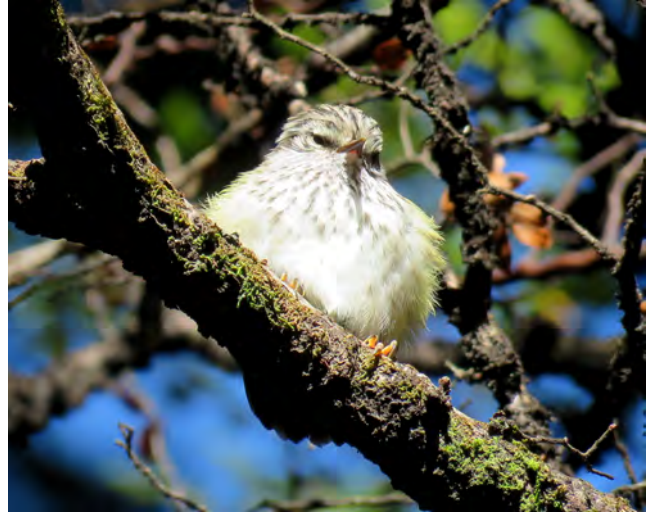
Immature male Rifleman having a relaxing sunning session, Arthur's Pass Village.

May 2 - To be confirmed at a later date.