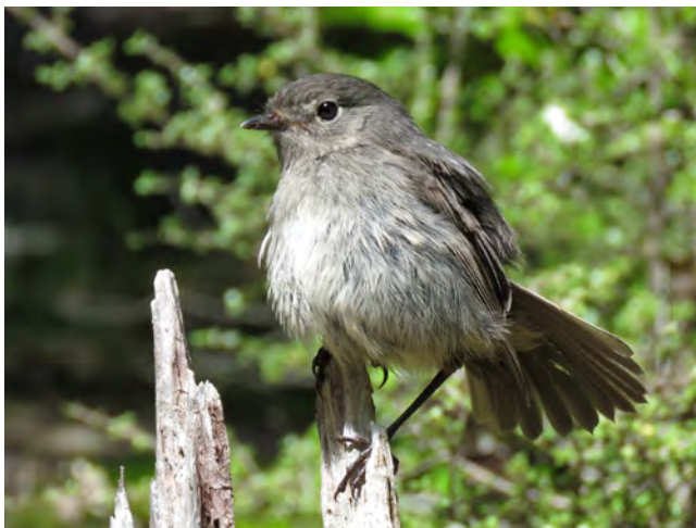
South Island Robin with its tail fanned out, Bealey Spur Track, Arthur's Pass National Park.