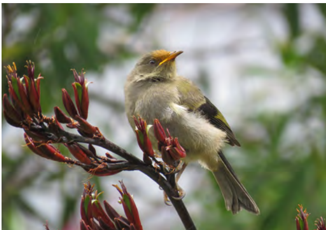
Immature New Zealand Bellbird, Arthur's Pass Village.