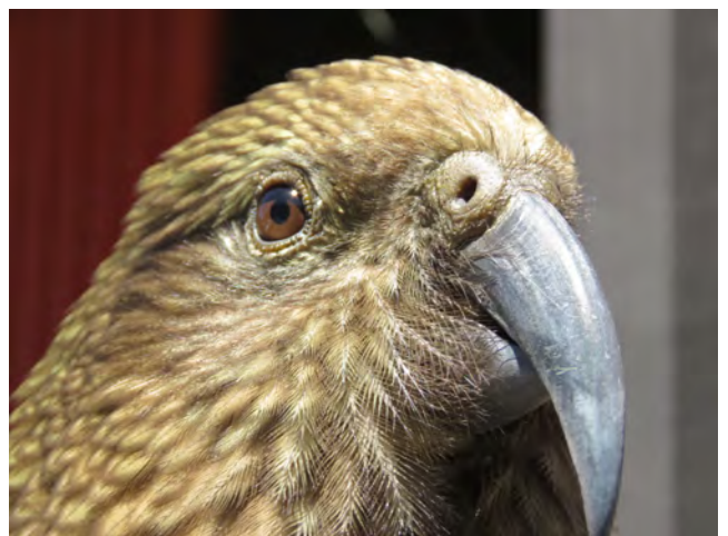
Kea having a very close look at my camera, Arthur's Pass Village. This Kea was literally only a few centimetres away from my camera when this photo was taken. It pecked my camera before moving on!