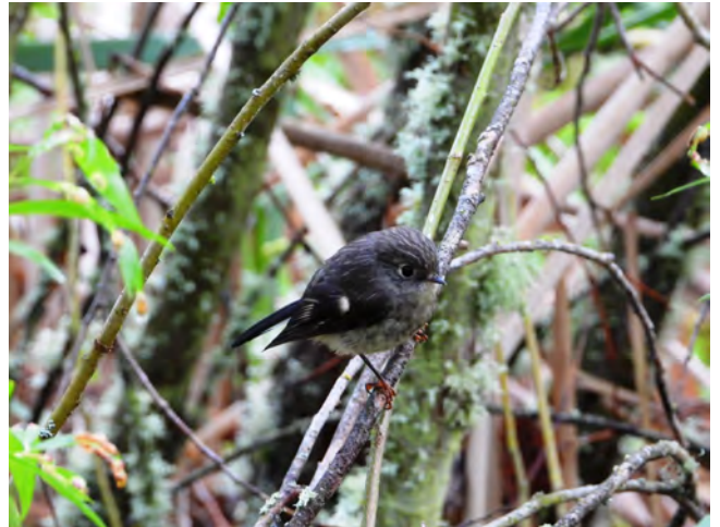
A young South Island Tomtit seen at Lake Ruataniwha. Later an adult was seen, so there was a family beside the lake. A good few bellbirds were around too.