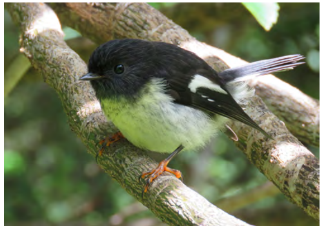
Young male Tomtit, Arthur's Pass Village.