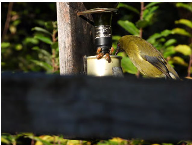
Bellbird at a feeder in Akaroa.

I went with friends on a weekend trip to Akaroa early in April. The weather was fantastic, and we visited areas I had not been before in search of bird life. Up one valley road we came across a lady who regularly fed sweet juice to the Bellbirds and Tui who were plentiful around her large property. She gave us a bottle of juice and invited us to watch the birds as they flew in.