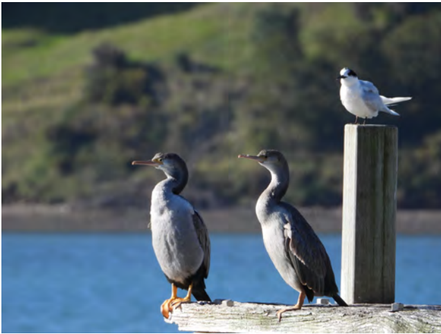
Spotted Shags and a White-fronted Tern in Akaroa.

I went with friends on a weekend trip to Akaroa early in April. The weather was fantastic, and we visited areas I had not been before in search of bird life. Up one valley road we came across a lady who regularly fed sweet juice to the Bellbirds and Tui who were plentiful around her large property. She gave us a bottle of juice and invited us to watch the birds as they flew in.