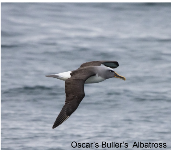
Oscar's Buller's Albatross