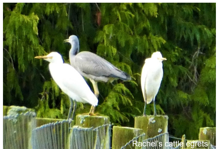
Rachel's cattle egrets