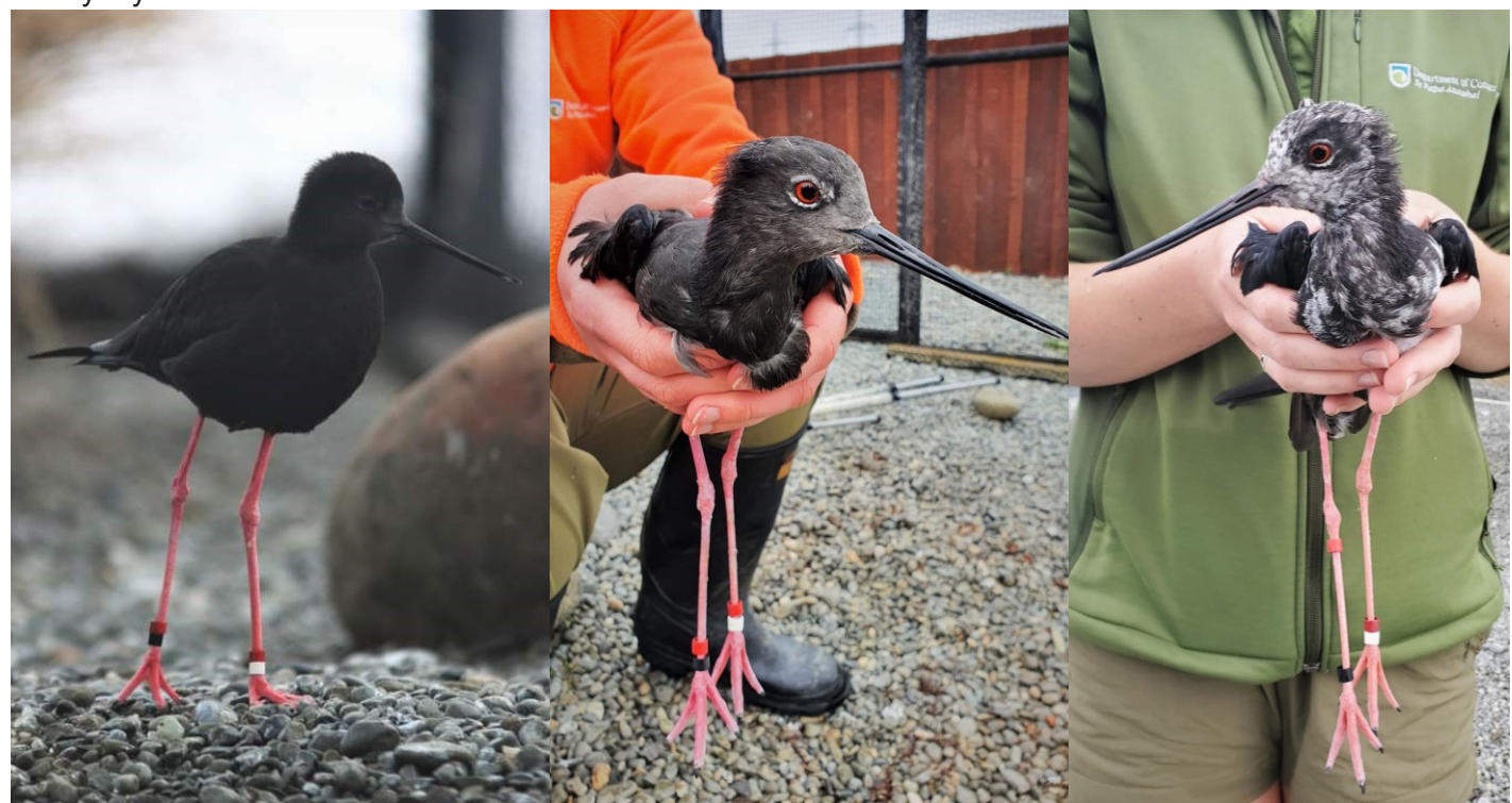
RW-RK in 2009, 2021 and December 2022!

In the last few months she has become quite grey, which strangely makes her appear to be ageing backwards. Her grey plumage now makes her look like one of the sub-adults in the aviary next door, but they are only a year old!