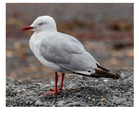
Michal Klajjban, CC BY-SA 4.0

Red-billed gull at Dunedin Wildlife Hospital "Dropped in to see if there was any free food on offer as there was another Red- Billed Gull in the hospital pool area. Stayed for about 30mins but no food was offered so departed again".