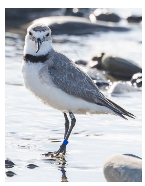
BW-BW in 2022

site, when he was with a banded female, WO-GO. We know they were together for at least 3 years, and even though they annually laid the usual 2 eggs, and chicks were hatched, we never saw any chick reach the flying stage. WO-GO then disappeared, presumably died, and next season BW-BW appeared with an unbanded female 3km further up the river at Groyne 2 near the airfield. He has returned to this site ever since. But as his mate is unbanded we don't know whether she was always the same bird. Even though their nest has been washed out by spring floods at least twice, they have always renested and done well up there, raising a total of 14 chicks. In the 2014-15 season they even double-brooded – that is had two nests in the one season and fledged 3 chicks. That does not happen very often on the Ashley-Rakahuri river.