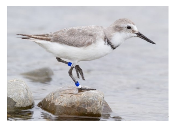
BW-BW, 2018

BW-BW was banded as a breeding adult male wrybill in 2010, when we reckon he was aged 2 – which means he is currently at least 14 years old. To our knowledge, no other banded bird has reached this age on the Ashley-Rakahuri river, and on average we only see banded birds for about 4 years. Why they don't last longer, we just do not know – because the oldest wrybills recorded have reached well over 20 years.