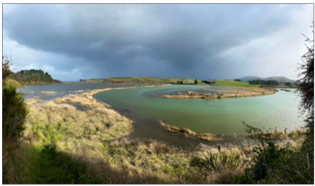
Flooding in the upper estuary, March 2023

If you are unable to join the field trip, why not head to a nearby birding hotspot and enter all your bird records on eBird (full checklists of at least 5 minute counts, please) towards to total for the Otago Region.