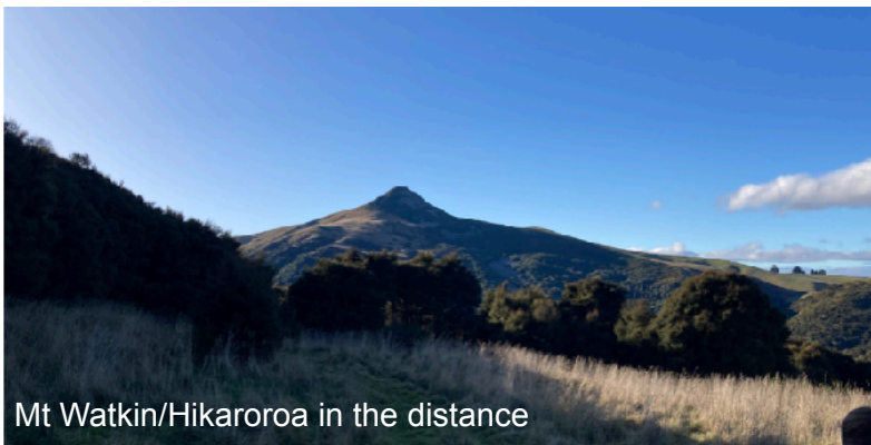
Mt Watkin/Hikaroroa in the distance