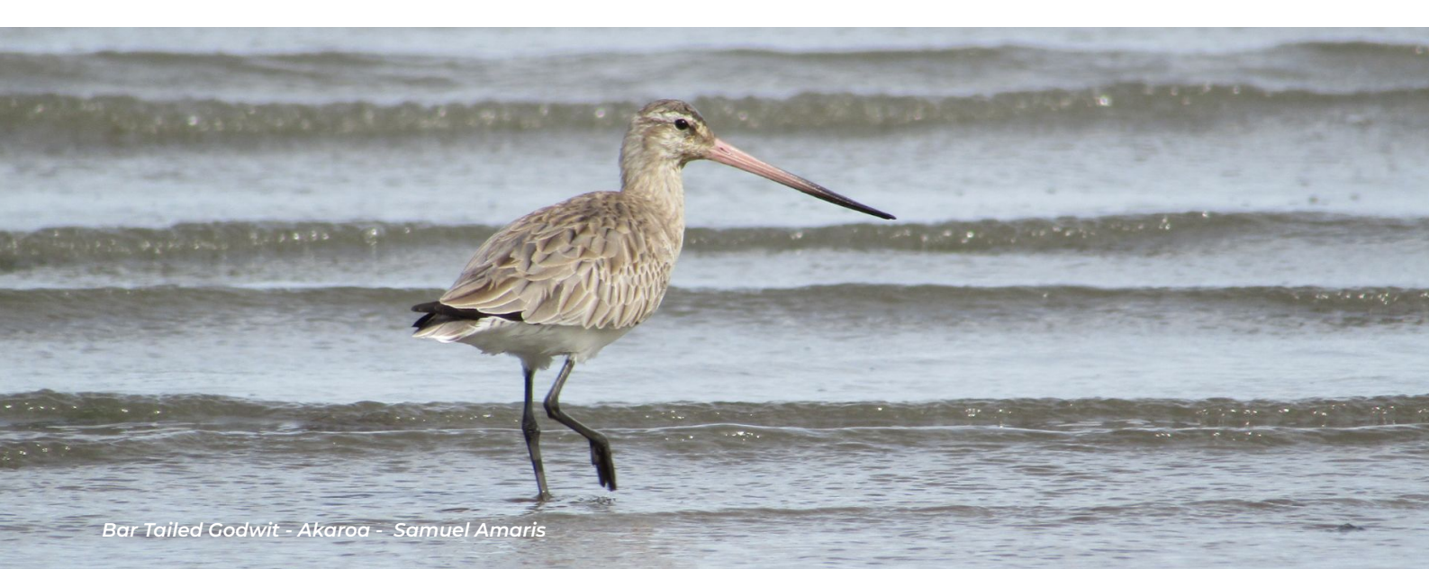
Bar Tailed Godwit - Akaroa - Samuel Amaris