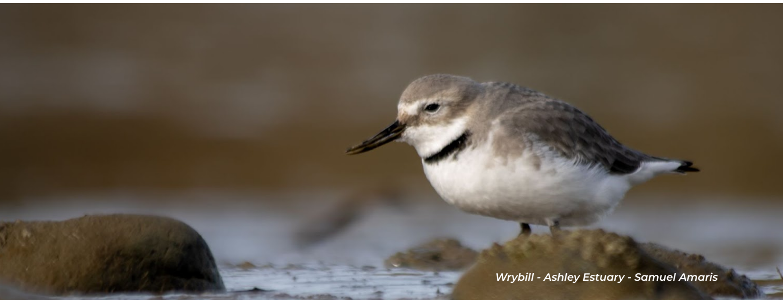
Wrybill - Ashley Estuary