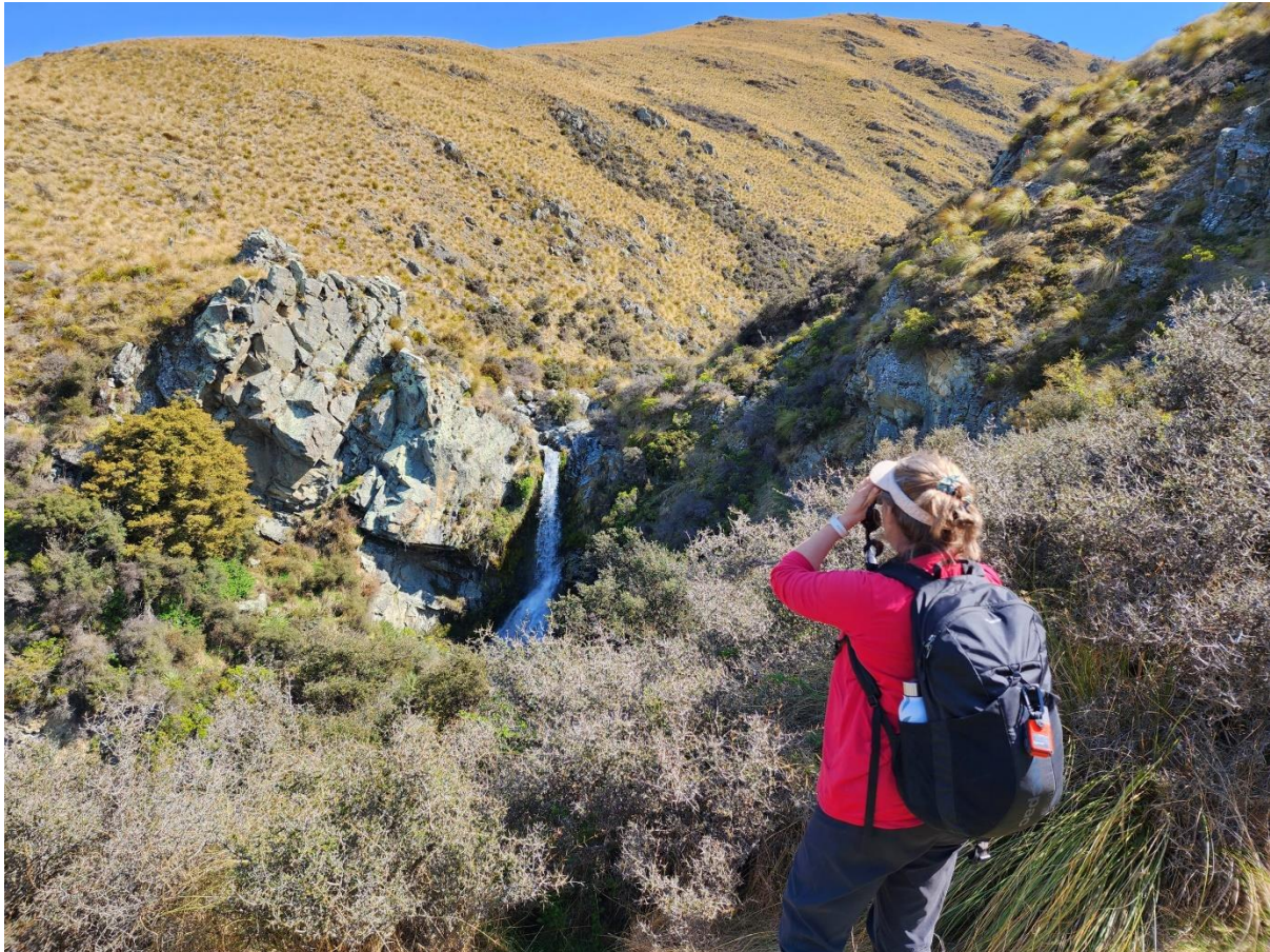
Atlasing in Naseby, October 2022

parts of the region, splitting into 4 teams and getting into the relevant squares by whatever means possible – along good roads, tracks, walking or wading through matagouri (not a good idea in shorts!). Areas visited included the upper Manuherikia, the Mount Buster track, Danseys Pass and Orangapai. All the desired squares received some coverage, apart from one which was an expedition in itself, and which will be the object of a return visit by one of the participants. Bird life was sparse in some of these areas, as expected, but patience revealed more species than were evident at first sight. On Saturday evening four teams set out at dusk in an effort to find ruru nohinohi/little owls , which have been heard and seen in the general area at other times of the year, but none were detected, despite apparently good conditions.