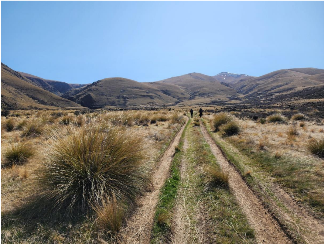
Following 4x4 access tracks Naseby, October 2022