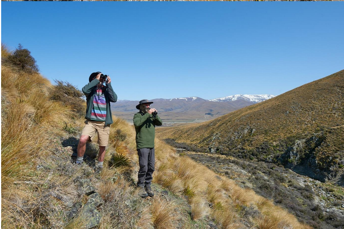
Otago Atlasers in Naseby, October 2022

11 Otago members headed to Naseby over the Labour Weekend (October 22-24 2022), with the intention of filling in empty Atlas squares , and topping up the under-surveyed ones, in the area. We assembled at the campground on Friday evening, and plotted our course of action for the next 2 or 3 days. The forecast was good for the Saturday, so we aimed high, literally, and went for the upland