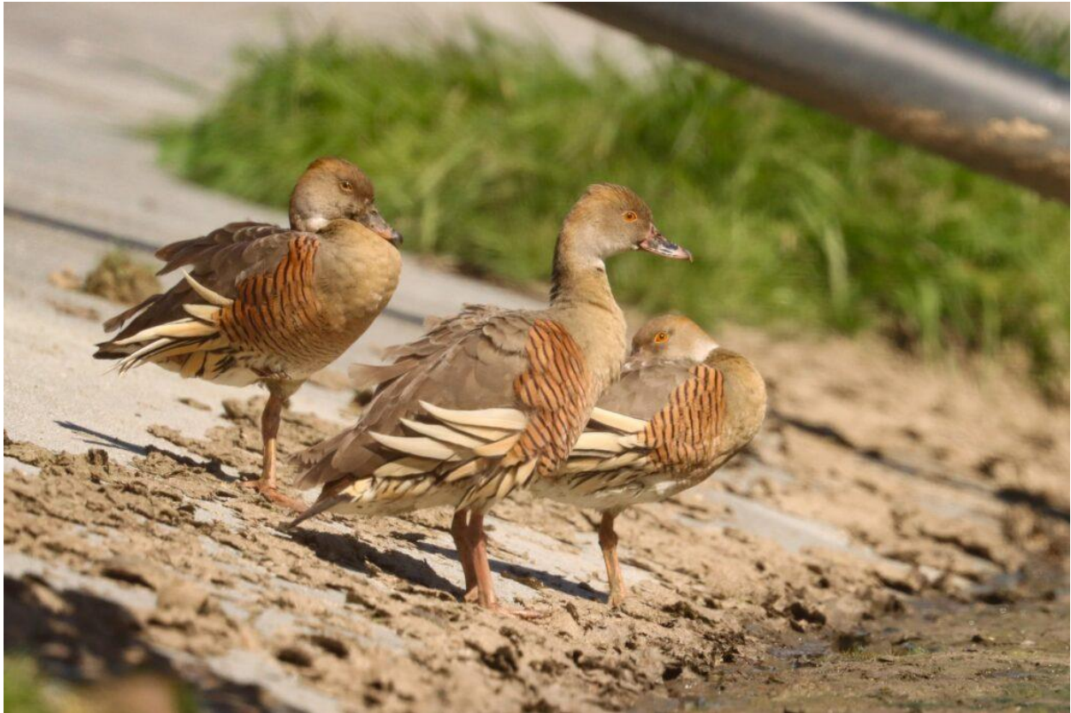
Plumed Whistling-Duck

The fun didn't stop after the sun went down, with groups targeting kororā/little penguins along the coast near Hokitika, and others targeting rorora/Great Spotted kiwi or ruru/morepork north of Hokitika.