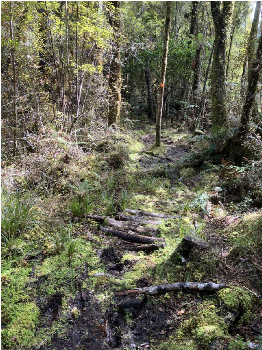
The rarely visited Saltwater Lagoon between Hari Hari and Whataroa.

Keen to make the most of the weather being so kind again, everyone was able to get another great day of Atlasing done on Sunday. Groups began to venture north towards Reefton and focused on under-surveyed areas near Mawheraiti, Maimai, Gloriavalle, Buller Creek Road, Cronadun, and Inangahua. One group explored a rarely visited Saltwater Lagoon between Hari Hari and Whataroa. The lagoon is huge and a special West Coast experience with a challenging track punctured with numerous boggy bits, windfalls and interesting stream crossings. This is one of the few places tītīpounamu/riflemen still exist close to sea level.