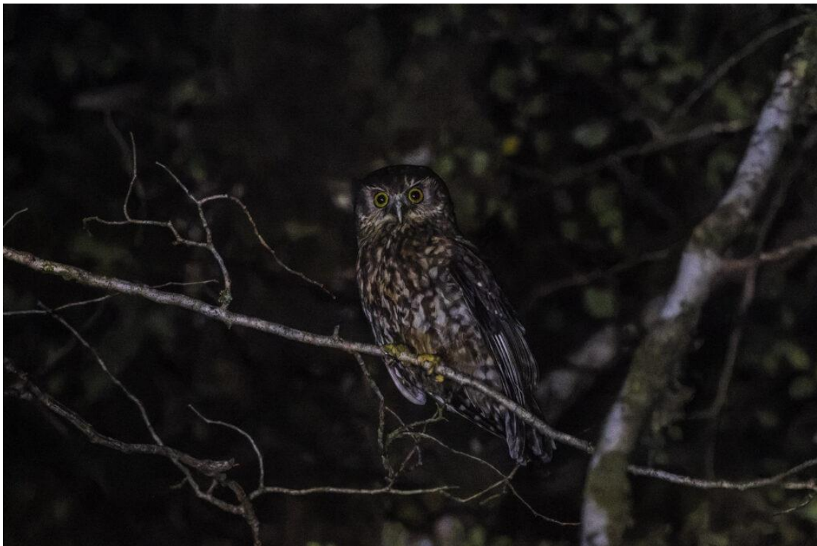
Ruru/Morepork. West Coast.

The fun didn't stop after the sun went down, with groups targeting kororā/little penguins along the coast near Hokitika, and others targeting rorora/Great Spotted kiwi or ruru/morepork north of Hokitika.