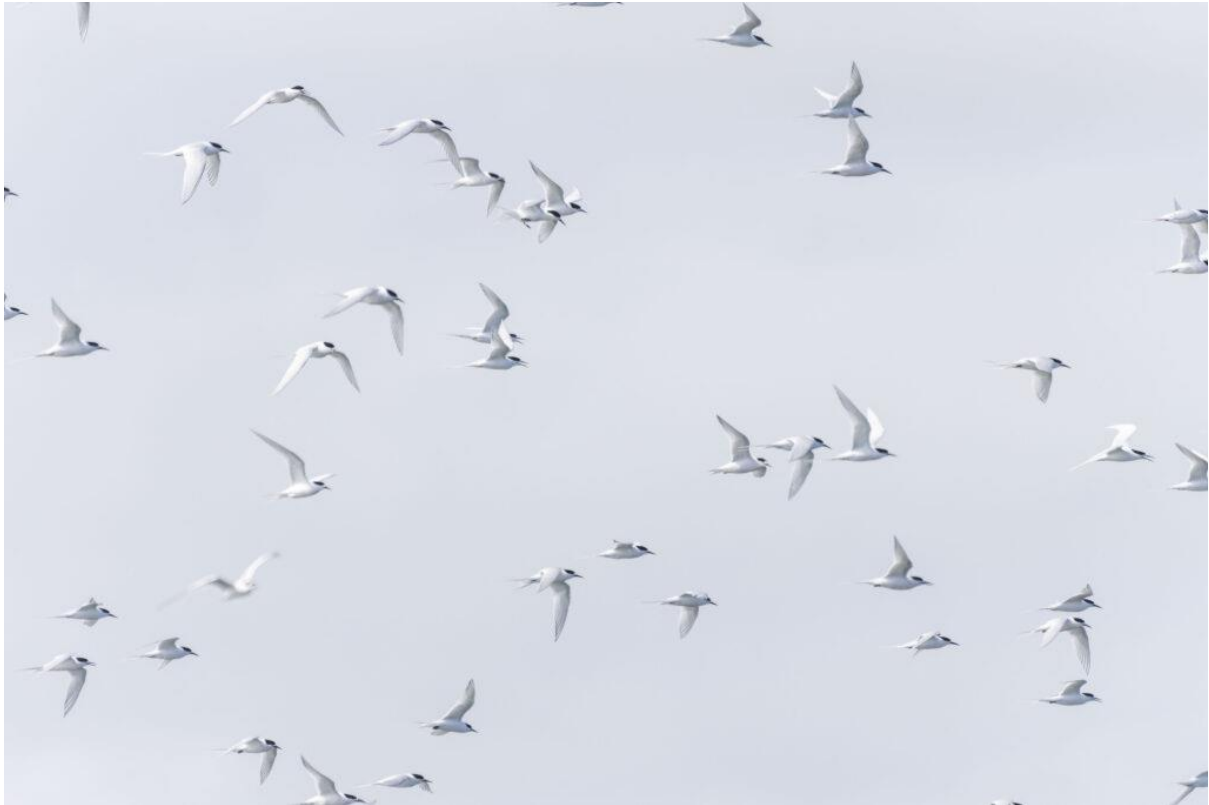
Tara/white-fronted terns. West Coast.