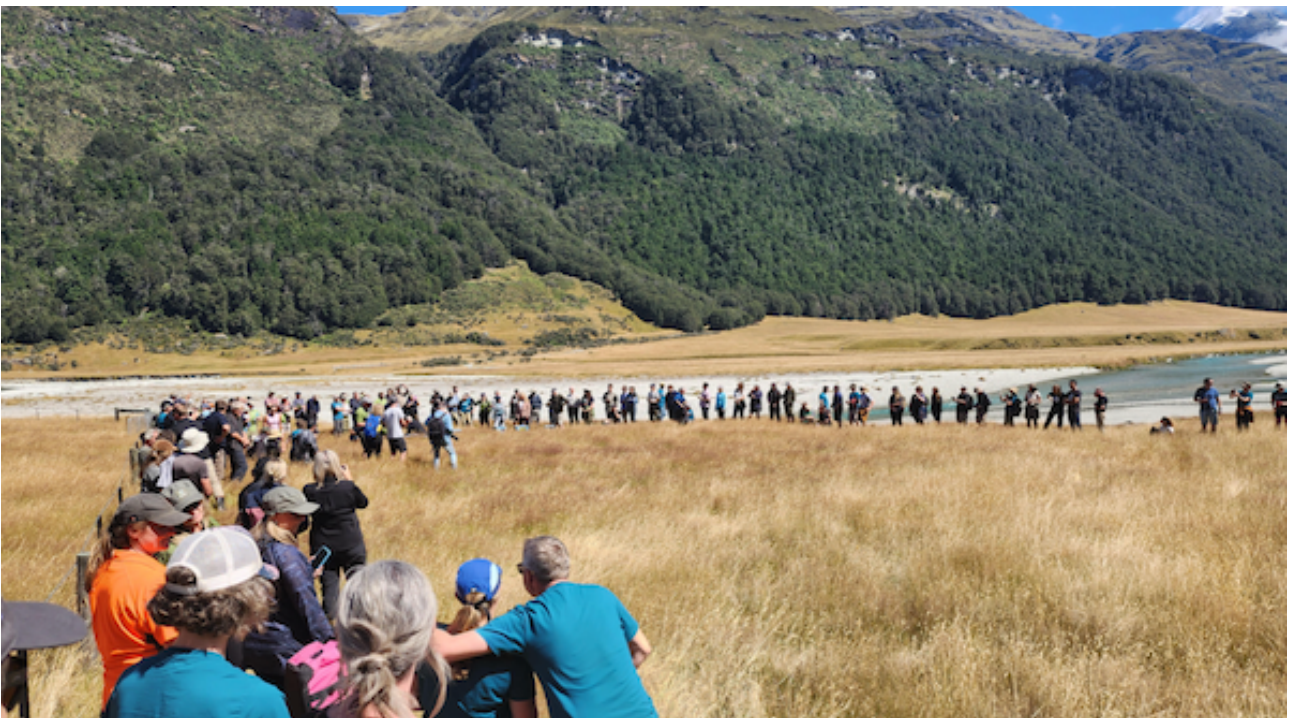
Release of takahe, Rees Valley