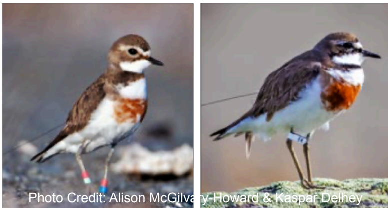
Examples of tagged Banded Dotterels with colour-bands (left, female "RB-RL") or an engraved leg-flag (right, male "5K").

They began fieldwork in the recent breeding season, banding approximately 280 adult banded dotterels (as well as some chicks) with either colour bands or 2-character, white alphanumeric flags. Some birds also received a PTT or GPS tracking device.