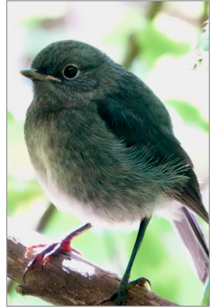
Fledgling

We recorded 24 territories in the 2024/5 season, below the 30 plus territories we have estimated in recent years, and there did seem to be fewer robins around this year – or possibly they were quieter and better at keeping themselves hidden.