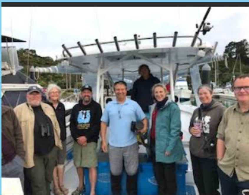
Photo - pelagic Trip November 2024 - Tutukaka/Poor Knights Islands