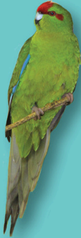
Red-crowned Kākāriki