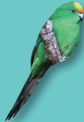
Orange-fronted Kākāriki

The Birds New Zealand Research Fund is funding new research on our endemic parakeets to help inform evidence-based conservation management.