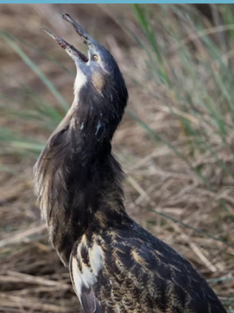
Matuku/bittern image by Imogen Warren