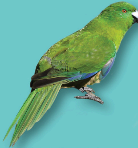
Antipodes Island Parakeet