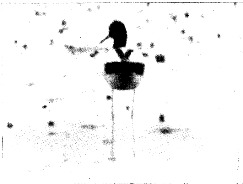
Plate XLIII (c) — Red-headed Avocet at Westport.