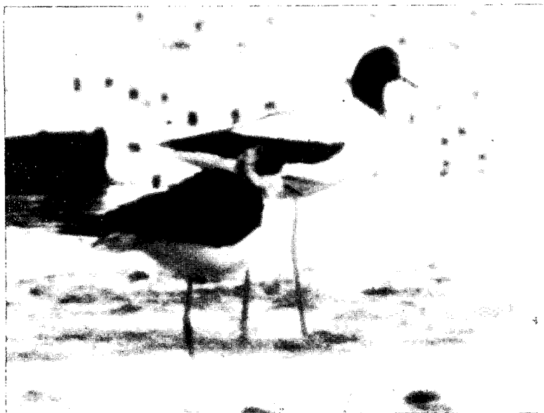
Plate XLIII (b) — Red-headed Avocet at Westport.