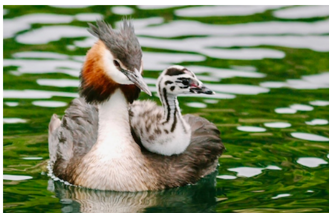
A grebe with a teenager on board