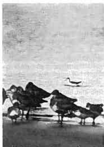
Wilson's Phalarope at Manawatu River estuary